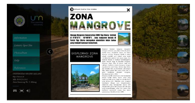
Figure 4. Information Display on Estuary Virtual Reality in Infographics

Through the use of skin element settings, Virtual Reality Estuary media provides various menus and features that can be accessed by users. The menu includes information, estuary sites, photo albums, and a help menu as a user guide. In addition, Virtual Reality Estuary media also provides various features to facilitate exploration activities through thumbnail list panoramas and button sets. Thumbnail list panorama serves as a tool to facilitate users to go to the desired location. Meanwhile, the button set offers many variations in supporting media usage such as audio on/off button, fullscreen, and VR glasses access button. Virtual Reality Estuary media display design was developed to facilitate the use of Virtual Reality Estuary media in the learning process.