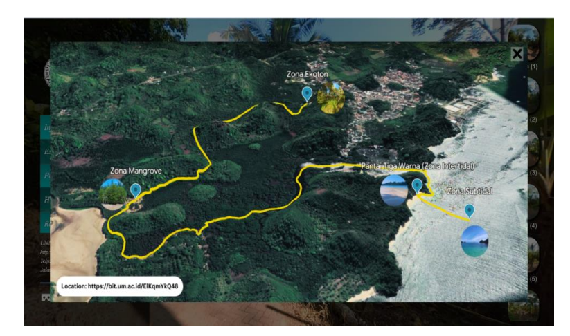
Figure 6. Spotsite Plotting Virtual Reality Estuary Panorama of Three Colors Beach Estuary