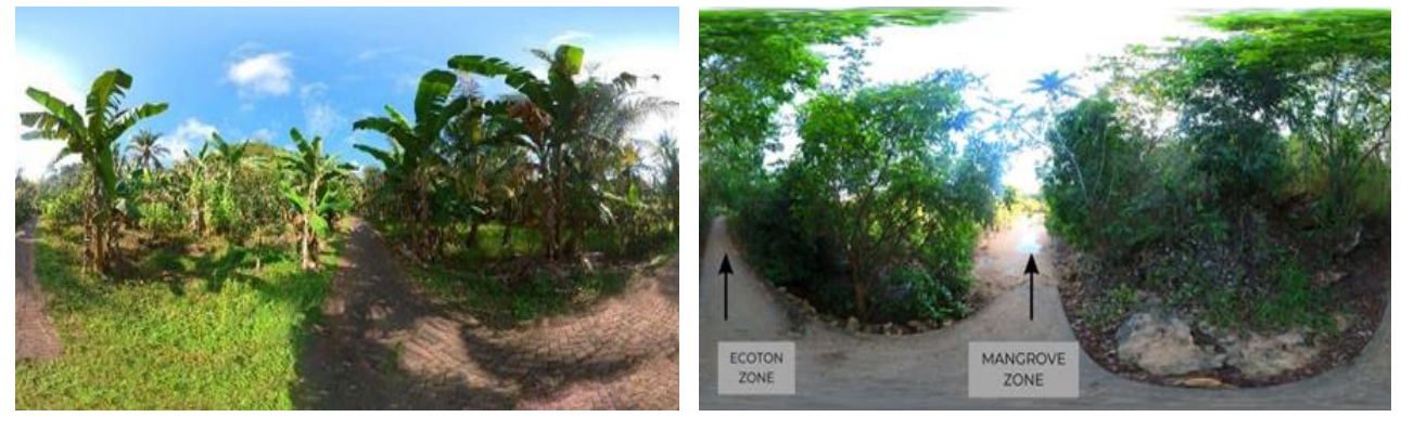
(a) Panoramic Photo of Ecotone Zone

Virtual Reality Estuary media development in the first exploration presented the ecotone zone (<u>table 2</u>). The material on ecotone zones is presented in the form of videos and photos. Users can obtain information related to the ecotone zone through the hotspots feature on the Virtual Reality Estuary media. Figures 7 are panoramic views presented to build Virtual Reality Estuary media in the ecotone zone. The ecotone zone is part of the Tiga Warna Beach estuary exploration area as a complex Geography learning study. Ecotone zone complexity has diverse ecosystems (<u>Ding et al., 2020</u>).