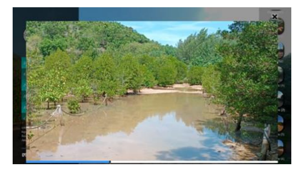
Figure 5. Video Information Display in Estuary Virtual Reality

Material information in Virtual Reality Estuary is presented using hotspots icons in infographic and video formats. In Figure 4 is a display of information in infographics on Virtual Reality Estuary media. In addition, Figure 5 is a video display on the virtual reality Estuary media which contains the environmental conditions of each estuary zone. The wide variety of utilization of the hotspots feature can facilitate users in information literacy and access to material content. The design of information and video displays in virtual reality (VR) media is a key aspect of creating an immersive experience for users.