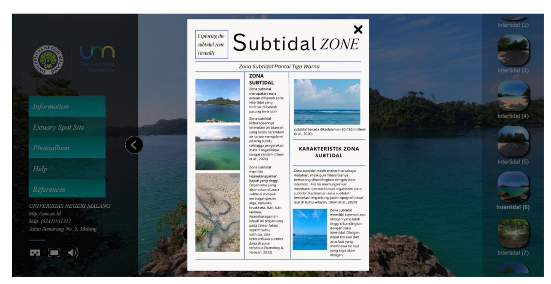
Figure 10 Spotsite 4 Subtidal Zone

Figure 9 (b) is a 360° panorama used in media development. Virtual Reality Estuary provides material content of the intertidal zone area. Figure 9 (a) shows information on the material content of the intertidal zone. The presentation of material content in the intertidal zone is based on the design of eco-spatial concepts and estuary conservation. Media supports virtual-based learning. Students can still explore the intertidal zone through Virtual Reality Estuary learning media that presents a 360° view (Meyer et al., 2019). The intertidal zone is a source of learning about coastal phenomena such as erosion, sedimentation, and sediment transport (Brand et al., 2019). In addition, the adaptation of organisms to the tidal environment is part of studying the intertidal zone (Leeuwis & Gamperl, 2022).