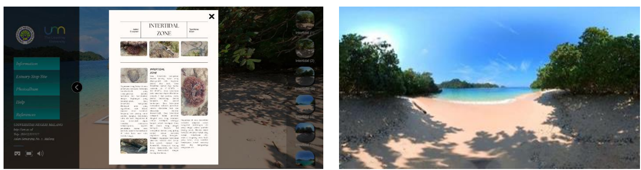
(a) Intertidal Zone Animal Ecosystem

Presentation of the next material content on the Virtual Reality Estuary media is a visualization of the environment in the mangrove zone area. Visualization in the form of a 360° panorama equipped with infographic information presentation as in <u>Figure 8</u> Mangrove zone is one of the important topics in Geography. This is in line with the position of the mangrove zone which is able to become a learning resource for coastal and marine ecosystem studies (<u>Aung et al., 2022</u>). Through this lesson, students can understand the importance of preserving coastal and marine ecosystems (<u>Sigit et al., 2020</u>). Mangrove forests can be utilized as a case study in Geography learning (<u>Sahrina et al., 2022</u>). Using virtual reality technology as learning media can reveal phenomena in mangrove forests (<u>Ou et al., 2021</u>). Virtual Reality Estuary can provide information about the geographical conditions of the mangrove zone.