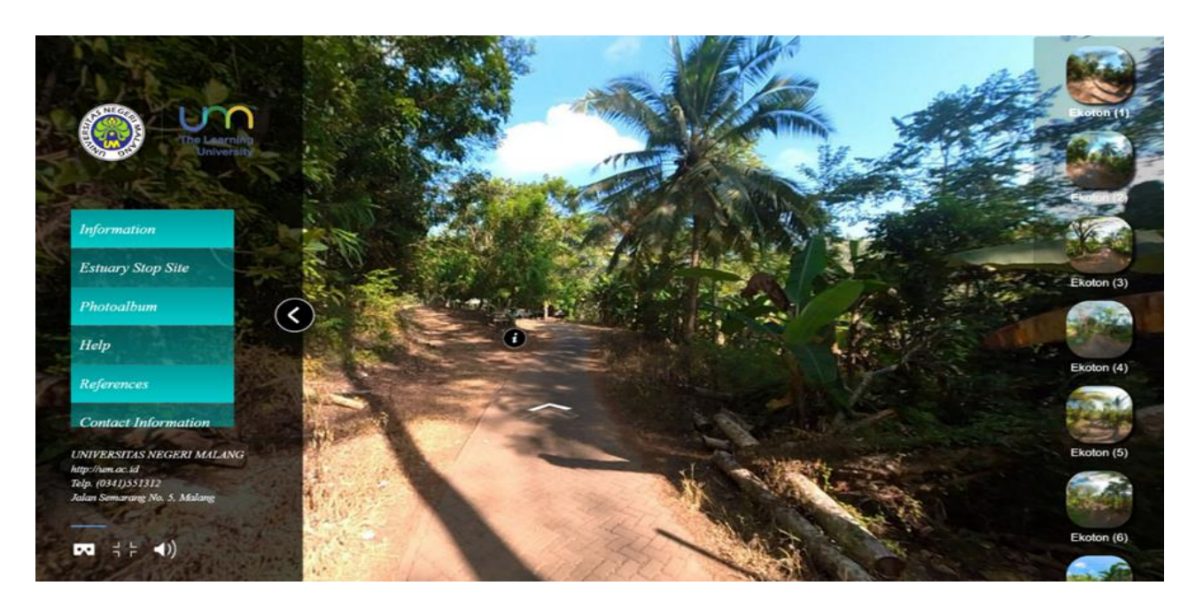
Figure 3. Main View of Virtual Reality Estuary

The Virtual Reality Estuary platform provides an advanced visualization interface, integrating eco-spatial concepts and estuary conservation principles into an immersive 360° panoramic view. This media can be accessed both online through the web platform and offline through mobile or desktop devices. Figure 3 describes the main navigation interface, displaying the main menu of the Virtual Reality Estuary display. This visualization is realized by utilizing the create 360° panorama feature which allows combining panoramic photos and providing information into Virtual Reality Estuary media. To facilitate navigation in virtual media exploration activities, it provides a hotspot feature to move to the next location. The hotspot feature comes with a selection of icons to simplify operation and movement of the panorama.