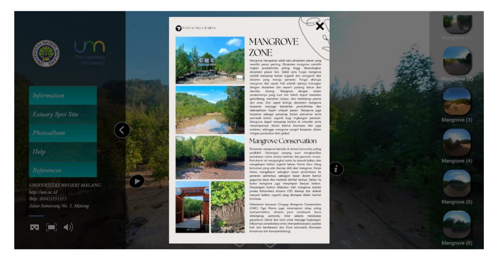
Figure 8. Spotsite 2 Mangrove Zone

Ecotone zones are transitional areas between different ecosystems, namely terrestrial and coastal ecosystems (<u>Schlacher et al., 2020</u>). Virtual Reality Estuary media can interact and explore various ecosystems in the ecotone transition zone. Students can develop a more holistic view of the ecological system of the ecotone zone through exploration activities. So that students' understanding of the ecotone zone contributes to environmental sustainability.