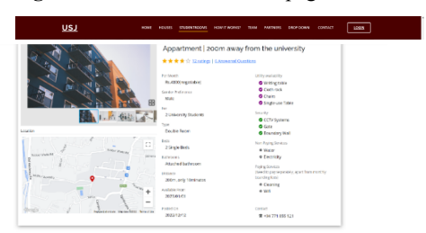
Figure 07: The Advertisement page

The information for the available student room or boarding houses are included on the advertisement page. All of these advertisements are controlled by the admin account (the owners of private boarding houses), which is overseen by the owner account (USJ). To help potential tenants acquire a general understanding of the student room or rentable house, the advertisements offer the following information.