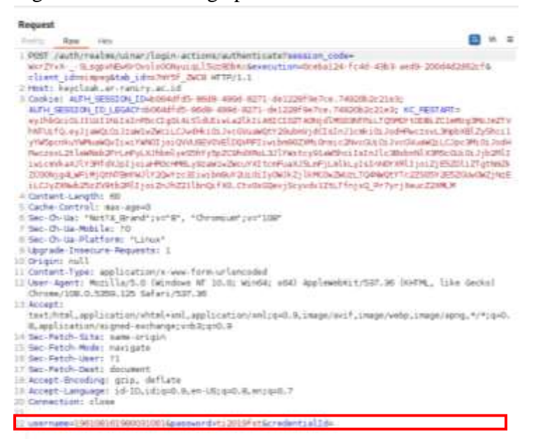
Figure 5. Interception Attack

find out if there is communication that is not properly encrypted by SSL/TLS, causing information leakage problems.