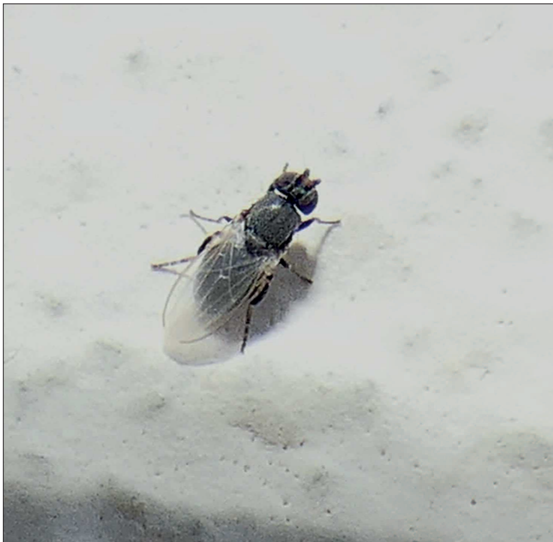
Leptommetopa latipes , Collection Natuurhistorisch Museum Maastricht, 5.II.2023

Resource link: http://www.faunaeur.org ; http://www.faunaitalia.it/checklist/