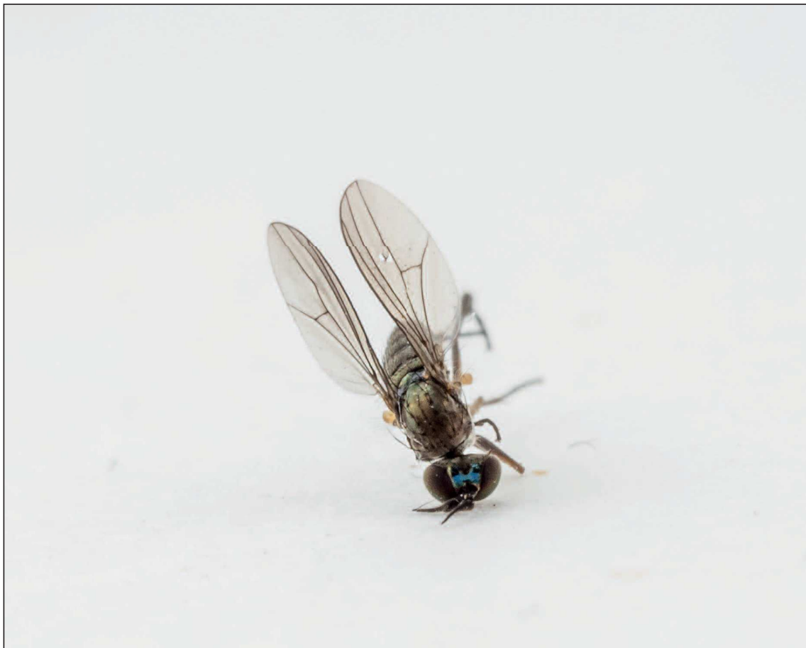
Syntormon mikii , Collection Natuurhistorisch Museum Maastricht

Resource link: http://www.faunaeur.org ; http://www.faunaitalia.it/checklist/