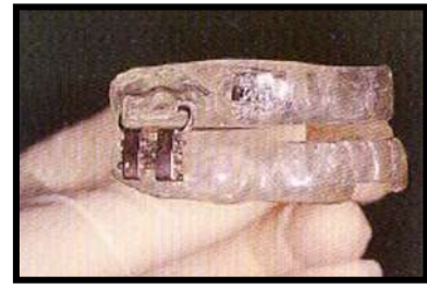
Figure 2. PM positioner