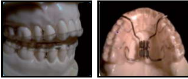
Figure 1. Klearway appliance