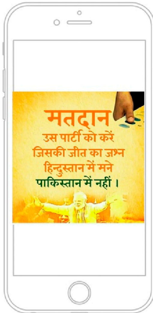
Figure 3. WhatsApp forward translation: “Vote for a party whose victory will be celebrated in India, not in Pakistan”. that is vote for the BJP not Congress. Received 15 February 2019.

President circulated a call on the WhatsApp group for a candlelit vigil in the neighbourhood to honour the ‘martyred soldiers’ (Figure 4).