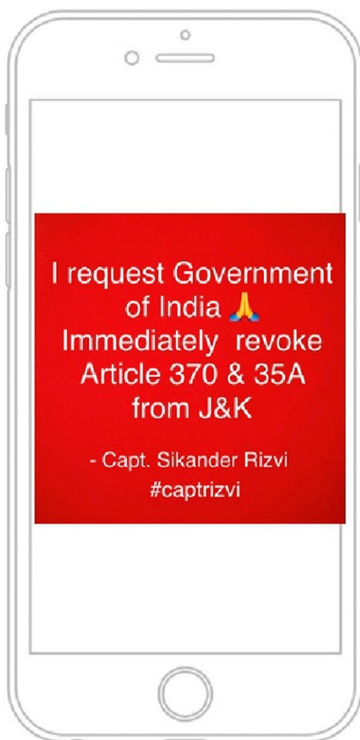
Figure 2. WhatsApp forward. Received 15 February 2019.

I live in New Delhi in a middle-class residential colony which, until recently, was a left-leaning, Congress supporting neighbourhood. But seduced by Modi’s popular and polarising politics (e.g. Figure 3) majority support has shifted to the Bharatiya Janata Party (BJP). Predictably, the RWA