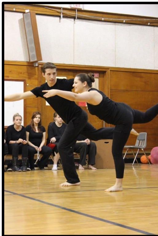
Figure 9. Movement Scene (Play)

Students who viewed the play were placed in focus groups and were subsequently interviewed to share insights about the themes that emerged from the play. At this time, elementary teachers and administrators were also interviewed. Finally, in the third phase of the body awareness study, I returned (along with a research assistant) to the eight schools to engage students in drama education workshops related to the topic of the play. Throughout the entire study, qualitative data sources included stories from the local community, films and work samples, scene breakdown and blocking charts, director's notes, interviews with students and teachers/administrators, fieldnotes, videos, photography, and focus group transcripts. For this article, I highlight the third phase of the body awareness study, that used the Mantle of the Expert approach (Heathcote & Bolton, 1995), storytelling, and playbuilding.