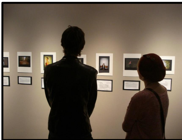
Figure 7. Exhibition Opening

In addition to the photographs and journals, structured interviews took place before and after the project. Three students from each of the two classes, as well as the two art teachers, were interviewed for the study.