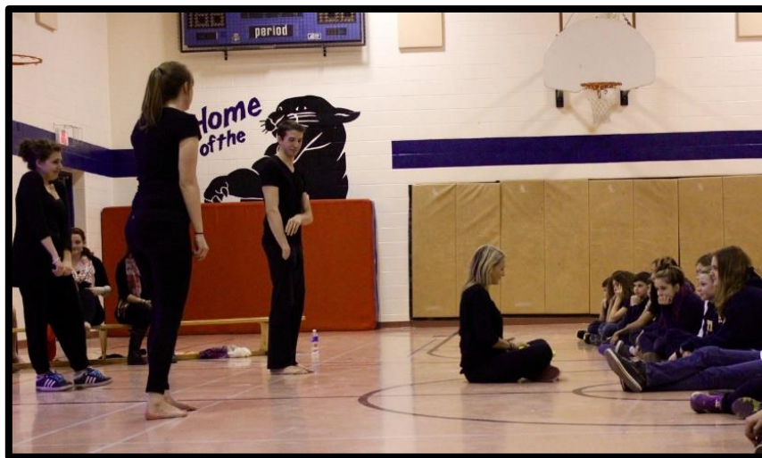
Figure 8. Body Awareness Scene (Play)

The subject for this portion of the CAZ project was body awareness, including the ways that stories are often embodied, socio-critical, and affective. The body awareness study was conceptualized in three phases. In the first phase, I invited various community organizations (e.g., fitness clubs, weight management groups) along with postsecondary students, and published authors and illustrators to submit stories regarding body image and embodied learning. These stories came to me in various forms (e.g., handwritten letters, emails, films, labelled photos). This invitation allowed participants agency in the sharing of their experiences related to the research topic. The participants were free to submit in whatever format they chose. Phase two consisted of bringing these gathered stories to a group of university undergraduate students, studying drama education and community theatre. Working with the instructor of the course, we planned, scripted, rehearsed, and produced a 45-minute play about body image over eight weeks, once a week for three hours each session. The play itself combined musical theatre, comedy sketches, soundscapes, digital collage, dance, voice montage, improvisation, and choral reading. The university students used the stories from phase one as resources for inspiration in order to compose the play, I'm Perfect/Imperfect: Perceptions of the Body and Embodied Learning . This play was then performed for eight elementary schools in the Niagara region (Grades 4–7).