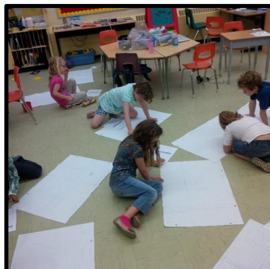
Figures 3 & 4. Mapping out the community

These children's choices affirmed the power of the arts as an entry point into various other curricular areas such as Literacy and Social Studies. It also highlighted the children's artistic expressions about, and aesthetic responses to, community-building. As a researcher, my observational goal during the inquiry was not so much to be focused on musical performance, but rather about attending to the ordinary musical moments that ebbed and flowed during the school day. The expressions of the children about this topic reflected the everyday moments that are integral to community-building. Ironically, while they were negotiating their performance through music-making (demonstrating agency), they were also building their own community within the classroom context by expressing their creativity and artistic responses.