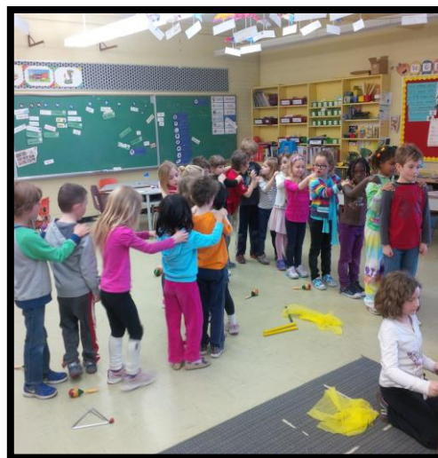
Figure 2. Movement

During this process, the classroom teacher provided opportunities for exploration so that the agentic learning environment focused upon aesthetic response and meaning making. It