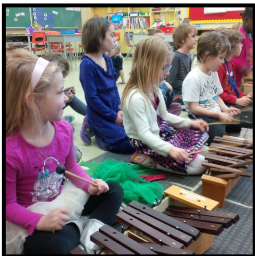
Figure 1. Performance Preparation

As I reflect upon moments during the inquiry that have highlighted aesthetic response and agency, I am drawn to share my observations regarding preparations that the Grade 1 children made for the local school district music festival. I witnessed the children working across modes while negotiating technical skills as they moved toward performance preparation. The classroom teacher and children co-developed a 10-minute performance using various modes including song, movement, body percussion, choral speech, classroom Orff instruments (both pitched and non-pitched), and narration, based around the theme of community in order to acquire French vocabulary.