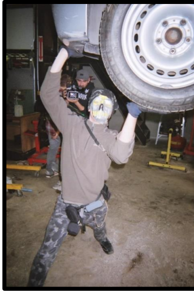
Figure 5. Student Participant (Role-Play)

To begin the project, students from both Class A and Class B researched and deconstructed the photographs of Cindy Sherman. The participating students were asked to create their own photographic images exploring the themes of teenage self-identity and role-play. Working in pairs, students were given disposable cameras to use as a tool to capture images of each other in various forms of role-play.