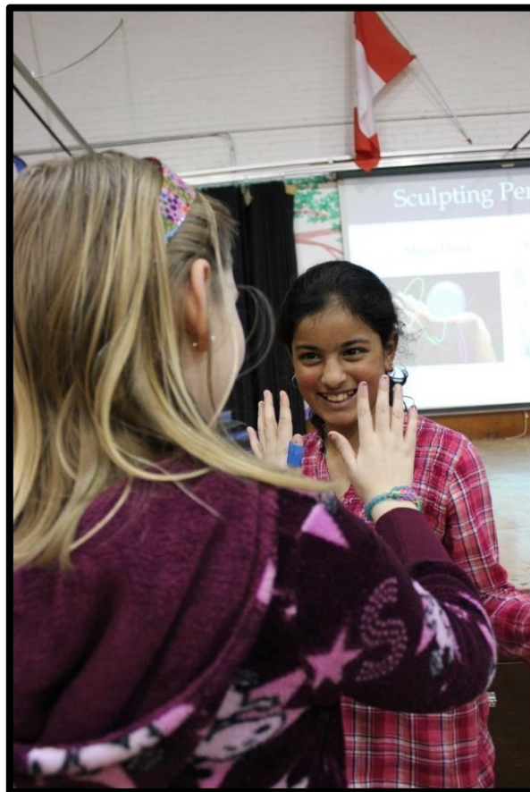
Figure 11. Writing Bodily Identities (Workshop)

Re-writing their bodily identities through artistic modes (through embodied, drawn, and vocal responses, for example) in the workshops became part of the practice of everyday life as there were more mechanisms for mediating body image.