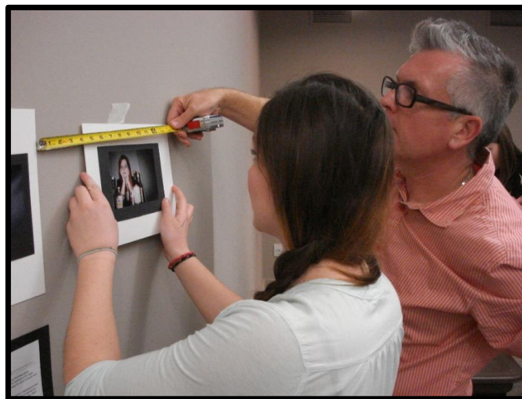
Figure 6. Installing the Student Photography Exhibition (with Gallery Director)

A celebration of the completed works resulted in a public exhibition at a local art gallery. The exhibition consisted of one photograph selected by each participating student, along with an accompanying written text. Students were invited to take part in the curating and hanging of the exhibition.