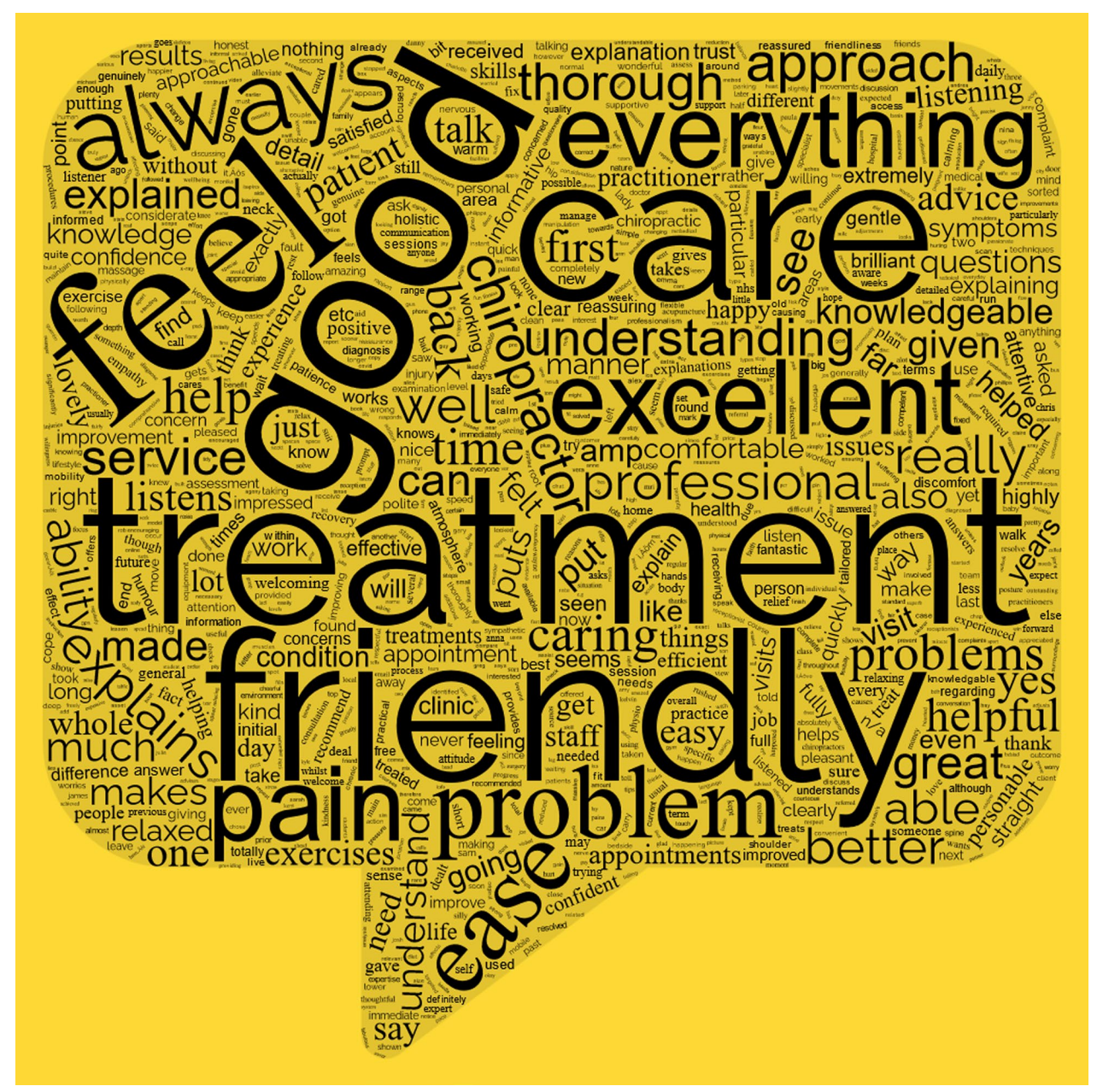
Fig. 1 "Good points" word cloud

with the treatment I received and believe my recovery has been swifter as a result."; "I feel as though she really cares about the problems I have, and confident that she can help."; "Put me at ease, good explaination of the problem, reduced worry, listened to my symtons/concerns—very proffesional."; "She is able to put me at ease, so I feel comfortable and confident in her treatment."; "Brilliant always friendly and makes me feel welcome and as comfortable as she can."