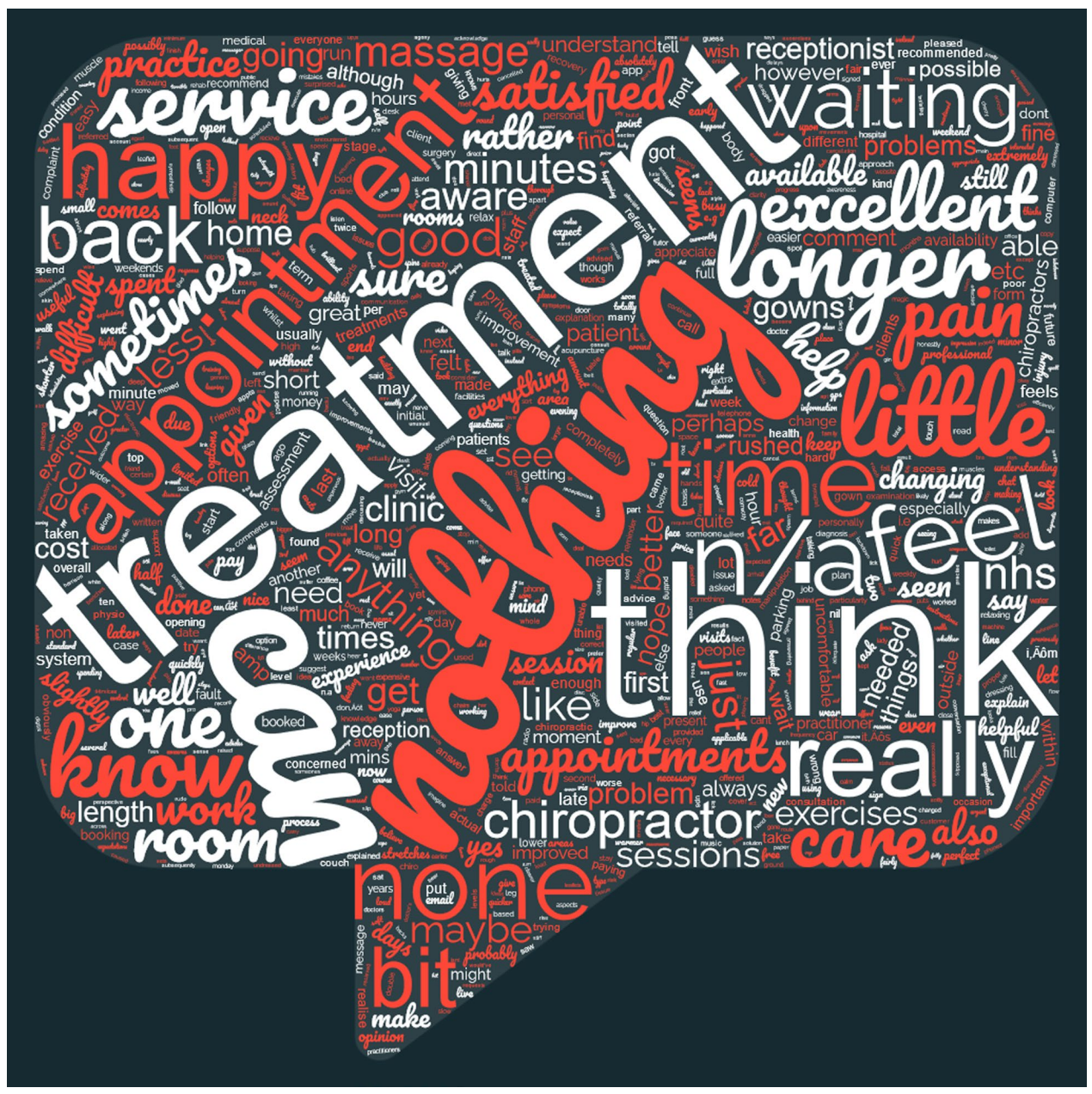
Fig. 2 "Improvements" word cloud