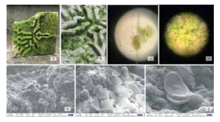
Figure 5. Analysis of green algae colonization of concrete tile (a. b. Colonized concrete tile; c. d. 40x visualization of green algae species; e. f. g. SEM observation of the green alga species "Cocconeis placentula")

Moreover, the moss transplanted in January 2022 onto a cement tile is still alive, exposed outdoors. On this basis the authors decided to set up the second cycle of experiments in 2023. Also, the lichen transplant that took place in January 2022 was successful, maintaining its vitality even after a year of indoor exposure. This also paves the way for the possibility of using these bioreceptive solutions indoors, with applications for biophilic design and bioremediation (and biomonitoring) of indoor air. Our findings regarding the bio-colonization are in line with those reported by Rely et al. (2019), who tested the installation of plants on concrete mixtures for green walls, observing the persistent vitality and development of the organisms. Moreover, regarding the effectiveness of the pattern and the material's features, our findings confirm what hypothesized by Manso et al. (2014) and Mustafa et al. (2021), by working with concrete features. With this study, we aim also at highlight how BD can provide materials experiences (Karana et al., 2015), that might become significant for more-than-human users too. Living organisms cannot report considerations on the sensory, emotional, significant and performative aspects, but these lev-