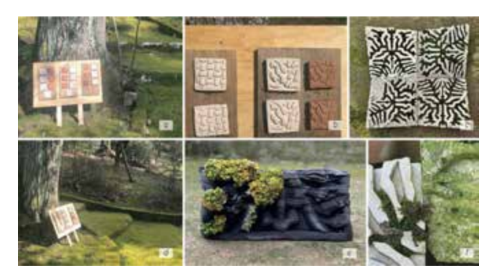
Figure 4. Tile exposure (a. b. d. Siena Botanical Garden; c. e. mosses and lichen transplant; f. Tiles exposure and first colonization by green algae)

cement and mortar; the latter were used for moss transplant and spontaneous colonization tests.