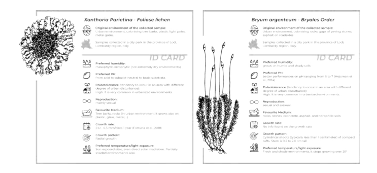
Figure 1. ID cards of the lichen Xanthoria parietina and the moss Bryum argenteum

As outlined in the BD procedural thinking (Pollini & Rognoli, 2021), at first it is necessary to acknowledge the life cycle and preferred living conditions of the organisms, to create suitable bioreceptive materials and artefacts. To do so, we selected two cosmopolitan species, widespread in heavily urbanized environments: the lichen Xanthoria parietina and the moss Bryum argenteum , and we created an ID cards for both of them (Figure 1).