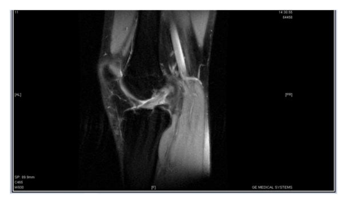
Figure 2. Magnetic Resonance imaging of the right knee joint.

The magnetic resonance imaging revealed damage to the right knee's anterior cruciate ligament (ACL). Subsequently, the patient was referred for arthrometric examination.