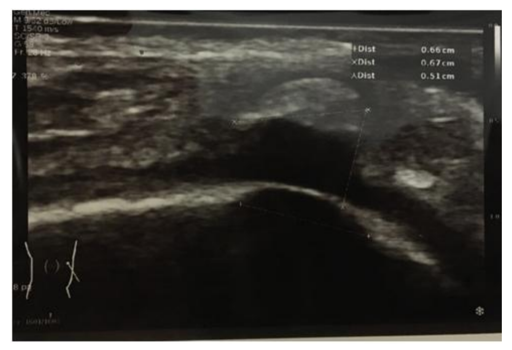
Figure 1. USG of the right knee joint. Avulsion fracture.

examination revealed no fluid in the knee joint cavity, cartilage at the condyle level with normal echogenicity and thickness without focal pathological changes. The quadriceps tendon, patellar ligament, and patellar ligament strands also showed no pathological changes. The lateral collateral ligament, iliotibial band region, and patellar tendon were normal. An avulsive detachment of a small bone fragment by the popliteus muscle from the lateral condyle of the femur was identified (the detached fragment had a diameter of 7 mm and was displaced laterally by about 5 mm). Subsequently, the ultrasound examination visualized the lateral collateral ligament, iliotibial band, biceps femoris tendon, and popliteus tendon - all structures were normal. The anterior and posterior cruciate ligaments, lateral and medial menisci, Hoffa's fat pad, and patellar alignment were all normal. No venous thrombosis was detected in the examination.