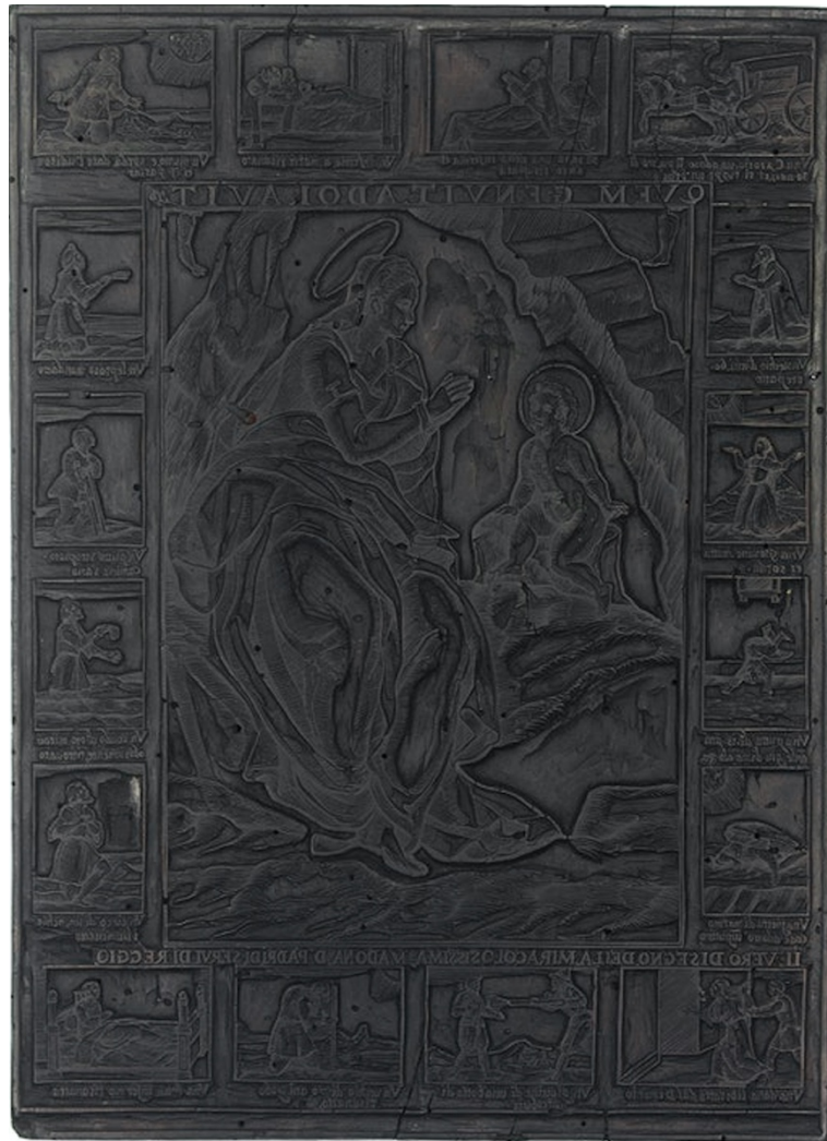
Fig. 44 Matrix of the Madonna of the Gravel and Miracles, 17th century, 373 x 271 mm. Fondo Soliani 4564, Galleria Estense, Modena..