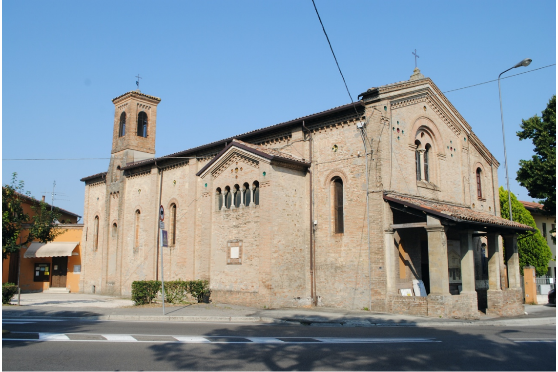
Fig. 55 Church of Saint Mary of the Vow, Forlì. (Photo: Author.).