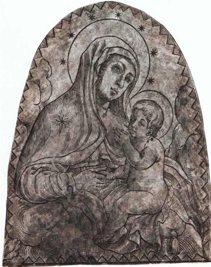
Fig. 60 Bartolomeo Coriolano, Madonna of the Maple , 1658, woodcut, 230 x 180 mm. Archive of the Sanctuary of the Madonna of the Maple, Bologna. (Photo: BeWeb.).