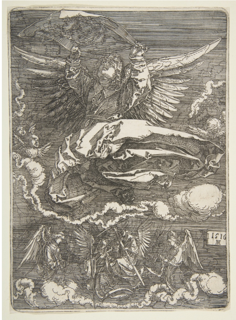
Fig. 4 Albrecht Dürer, Sudarium Held by an Angel , 1516, etching, 186 x 133 mm. Metropolitan Museum of Art, New York.