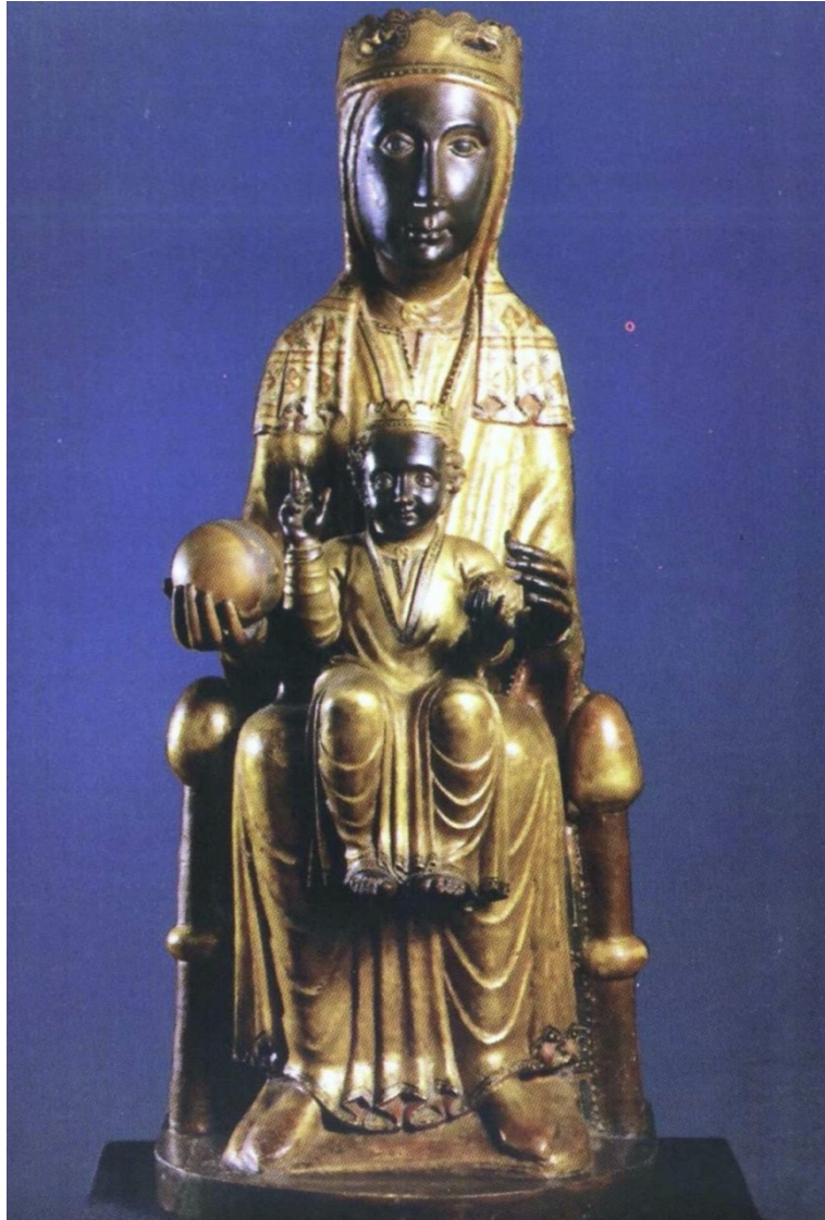
Fig. 12 Virgin of Montserrat , 12th-13th centuries, wooden sculpture, 950 mm. Sanctuary of Montserrat, Montserrat. (Photo: Wikipedia.).