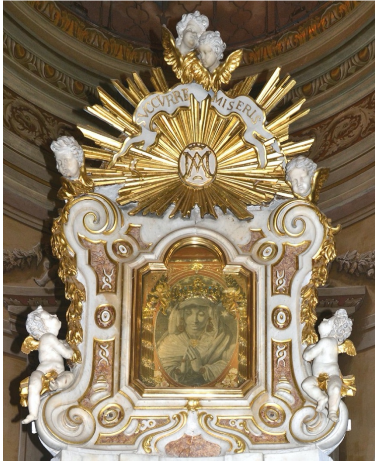
Fig. 8 Our Lady of Succour , early 18th century, etching on paper, 680 x 540 mm. Church of San Bartolomeo della Ginestra, Sestri Levante. (Photo: BeWeb.).