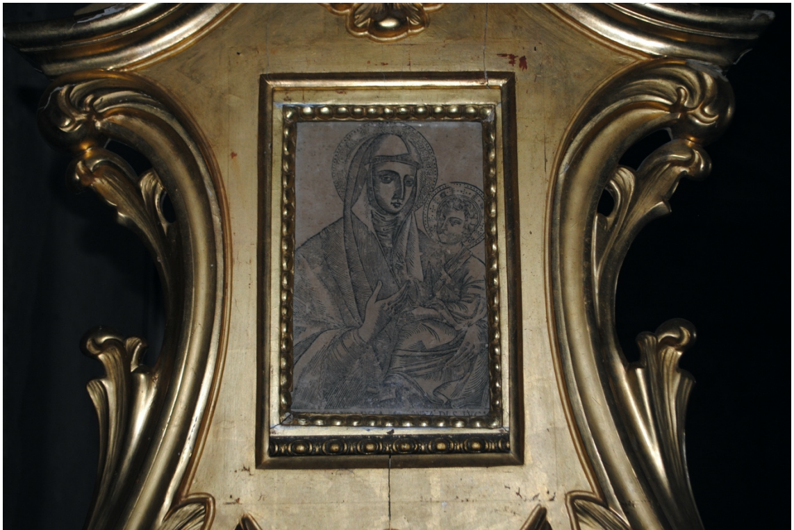
Fig. 38 Madonnina of Saint Luke , early 17th century, woodcut on paper, 260 x 170 mm. Oratory of the Madonnina of Saint Luke, Guiglia..