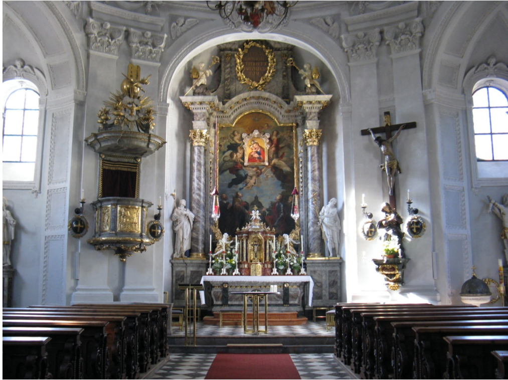
Fig. 31 Church of Mariahilf (Interior), Innsbruck. (Photo: Wikipedia.).