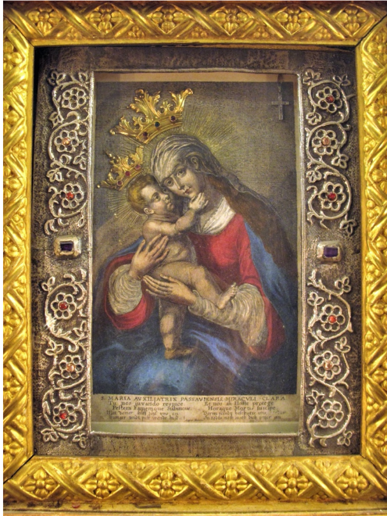
Fig. 11 Madonna of Passau , mid-17th century, water-coloured engraving on paper, 250 x 200 mm. Church of Pragatto, Pragatto. (Photo: Andrea Baratta.).