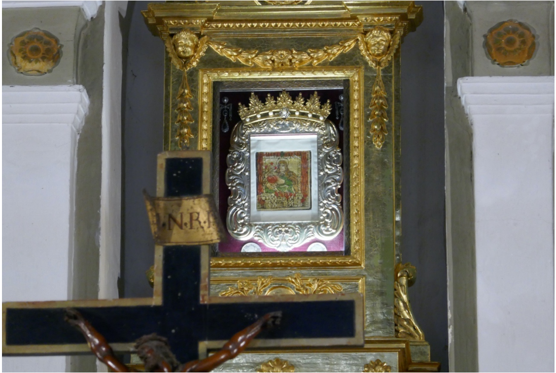
Fig. 52 Saint Mary of the Vow , 16th century, hand-coloured woodcut on paper, 110 x 100 mm. Church of Saint Mary of the Vow, Forlì. (Photo: Author.).