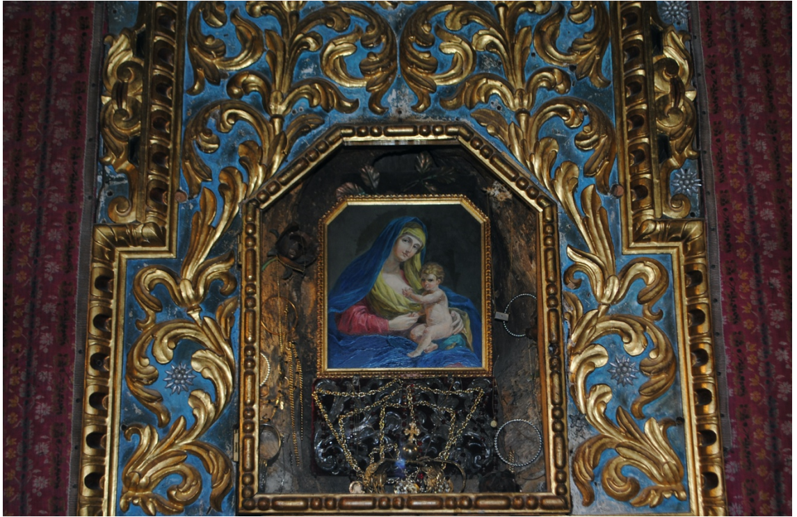
Fig. 59 Madonna of the Maple (copy), 19th century, copperplate painting, 280 x 260 mm. Sanctuary of the Madonna of the Maple, Lizzano in Belvedere. (Photo: Author.).