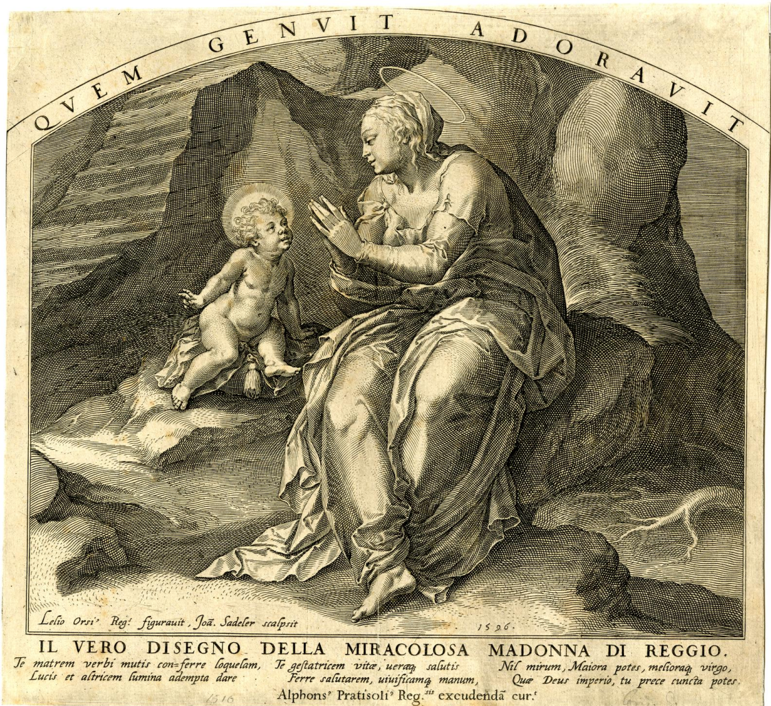
Fig. 41 Jan Sadeler I (after Lelio Orsi), Madonna of Reggio , 1596, engraving, 218 x 234 mm. British Museum, London.