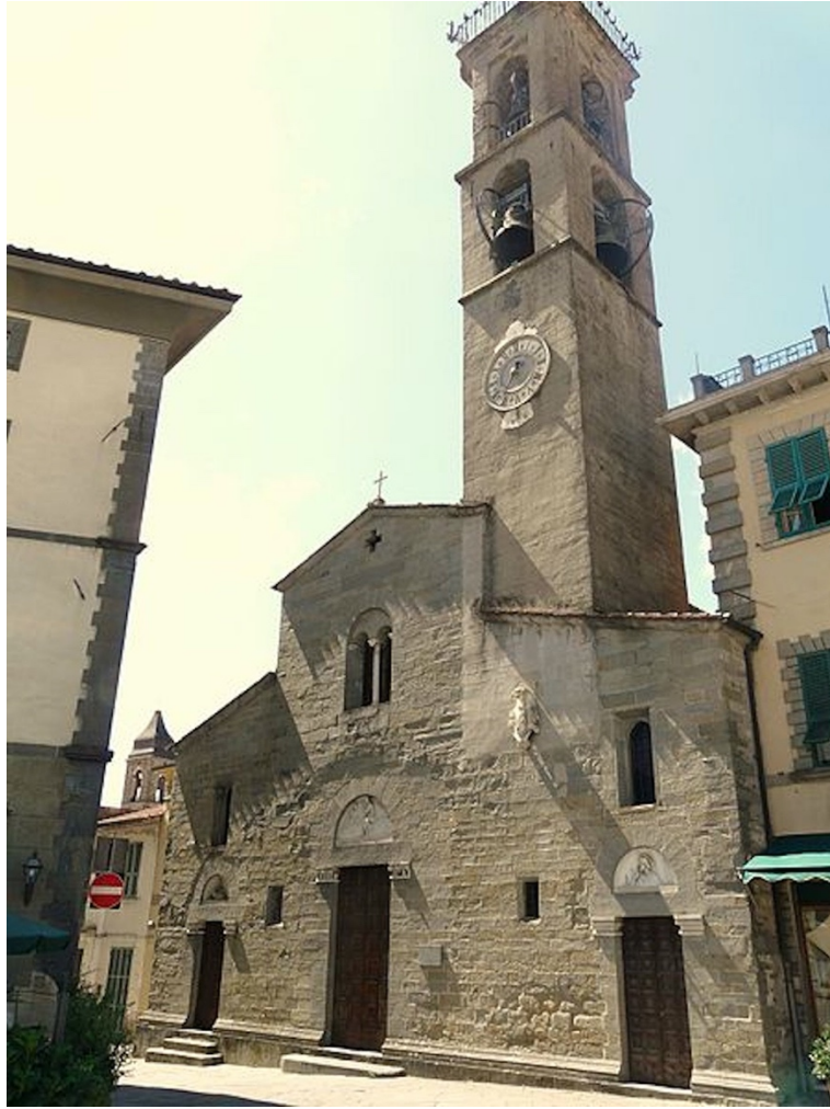
Fig. 45 Church of Saints Jacopo and Anthony, Fivizzano..