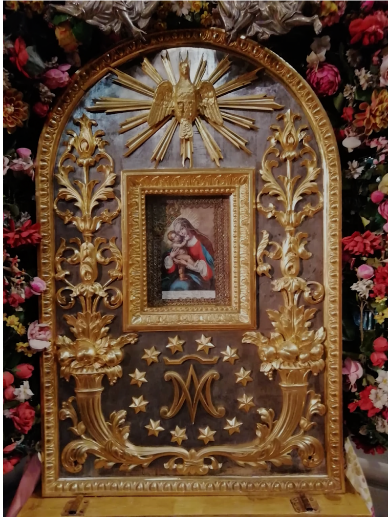
Fig. 36 Processional Madonna of Passau , 18th century, engraving, 250 x 200 mm. Church of Pragatto, Pragatto..