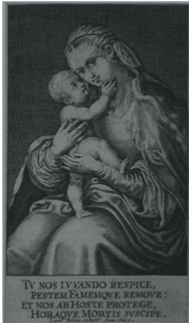
Fig. 32 Lucas Kilian, Mariahilf , 1625, engraving, 150 x 880 mm. Wolfegg Collection, Wolfegg. (Photo: Jörg, Probst. Reproduktion: Techniken und Ideen von der Antike bis heute; eine Einführung , 2011.).