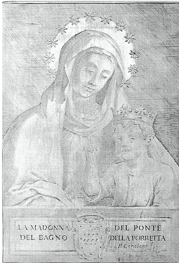
Fig. 62 Giovanni Battista Coriolano, Matrix of the Madonna of the Bridge, 17th century, 200 x 142 mm. Church of Saint Mary Magdalene, Porretta Terme. (Photo: BeWeb.).