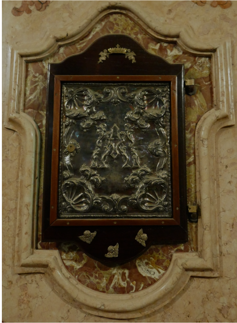
Fig. 21 Tabernacle of the Madonna of the Graces. Church of Stuffione di Ravarino, Stuffione di Ravarino. (Photo: Author.).