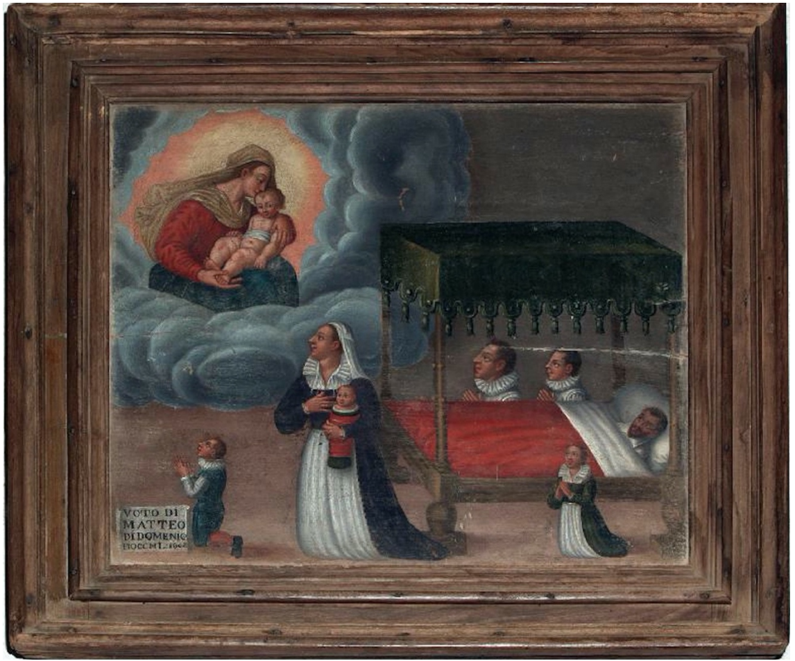
Fig. 65 Madonna of the Maple , 1608, painting in tempera on panel, 570 x 680 mm. Sanctuary of the Madonna of the Maple, Lizzano in Belvedere. (Photo: BeWeb.).