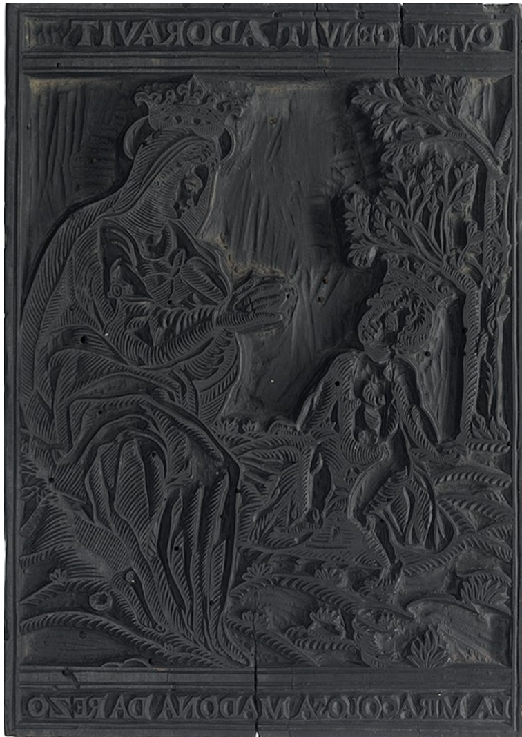
Fig. 43 Matrix of the Madonna of the Gravel, 17th century, 248 x 176 mm. Fondo Soliani 4741, Galleria Estense, Modena. (Photo: Galleria Estense.).