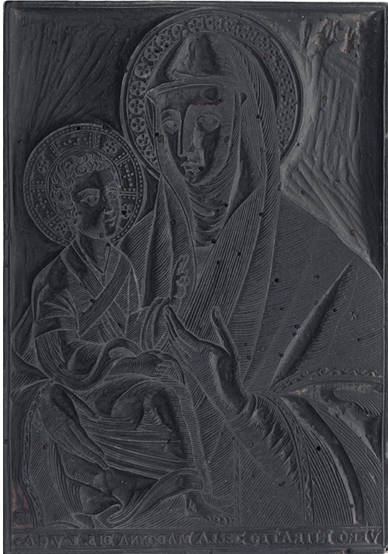
Fig. 48 Matrix of the Madonna of Saint Luke, 17th century, 257 x 179 mm. Fondo Barelli 4664, Galleria Estense, Modena. (Photo: Galleria Estense.).