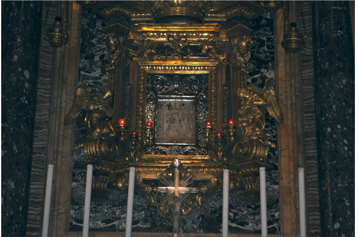
Fig. 2 Madonna of the Fire , ante 1460, coloured woodcut on paper, 490 x 400 mm. Cathedral of Forlì, Forlì. (Photo: Author.).