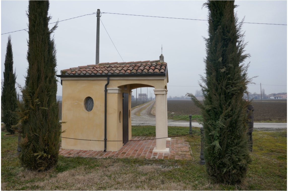
Fig. 20 Oratory of the Madonna of the Graces, Stuffione di Ravarino. (Photo: Author.).