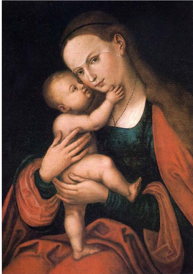
Fig. 28 Madonna of Passau , early 17th century, oil on panel, 1300 x 950 mm. Church of Mariahilf, Passau. (Photo: Andrea Baratta.).