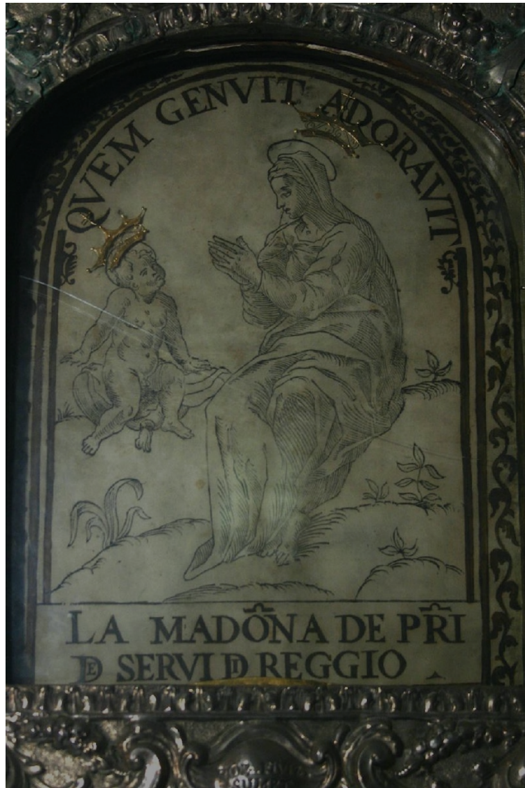
Fig. 6 Blessed Virgin of the Adoration, 1590-1599, woodcut on parchment, 350 x 290 mm. Church of Saints Jacopo and Anthony, Fivizzano.