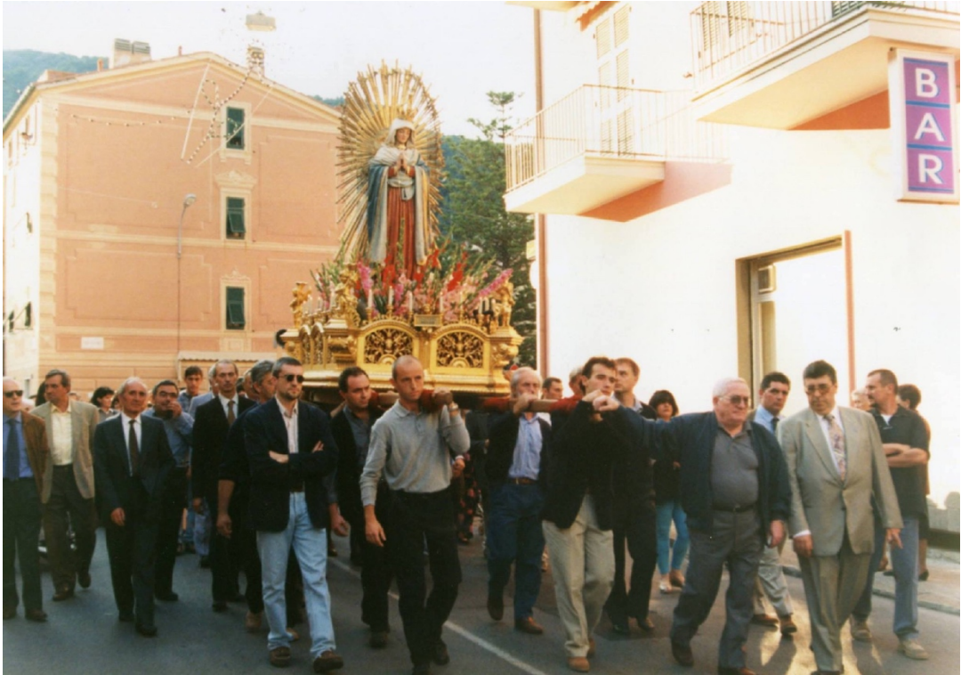
Fig. 9 Procession of Our Lady of Succour. Sestri Levante..