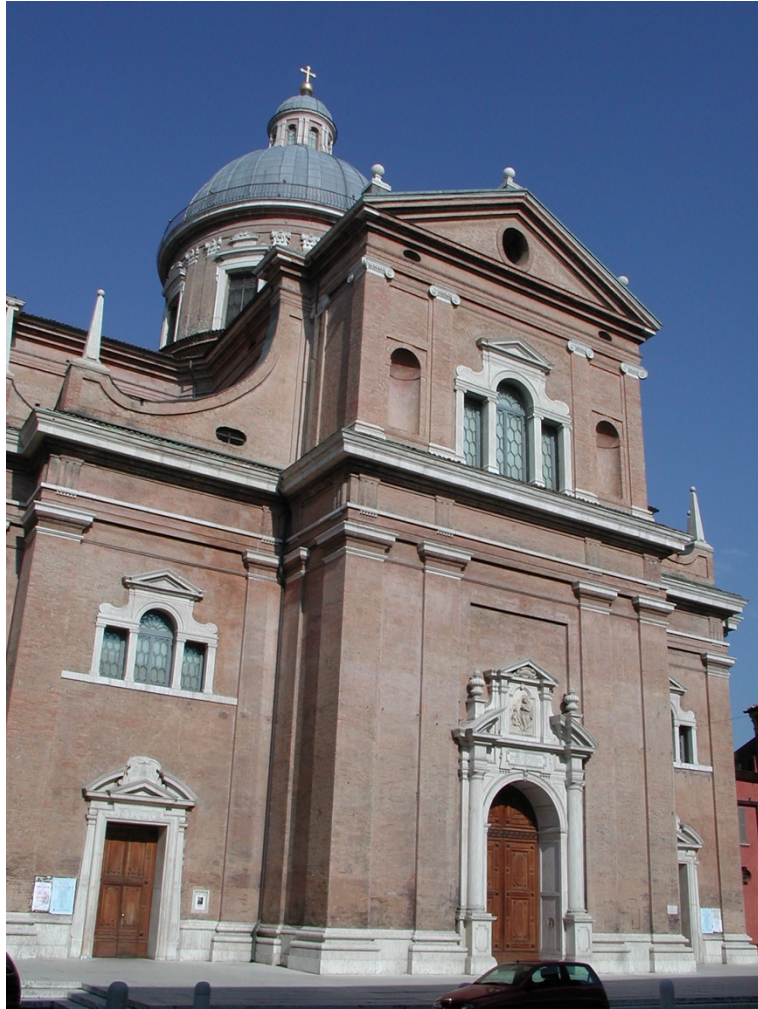
Fig. 40 Basilica of the Madonna of the Gravel, Reggio Emilia..