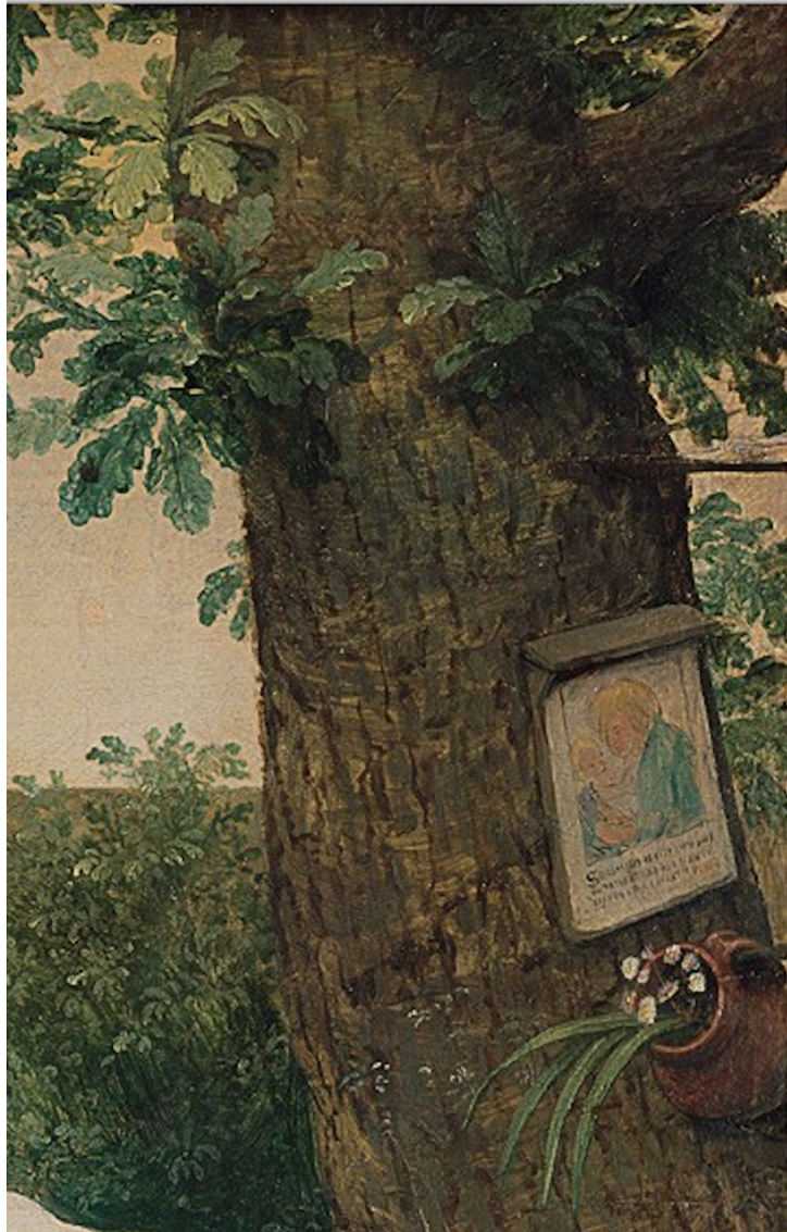
Fig. 19 Pieter Bruegel the Elder, The Peasant Dance (detail), 1567, oil on panel. Kunshistorisches Museum, Vienna. (Photo: Wikipedia.).