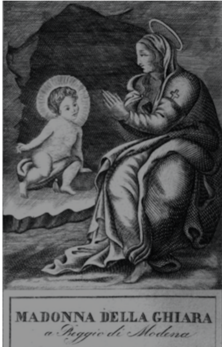
Fig. 42 Madonna of the Gravel , 1659, engraving. Atlas Marianvs . (Photo: Gumpfenberg, Wilhelm. Atlas Marianvs: sive, De imaginibus Deiparae per orbem Christianum miracvlosis . Ingolstadt: Officina typographica Ioannis Ostermeyeri, 1659.).