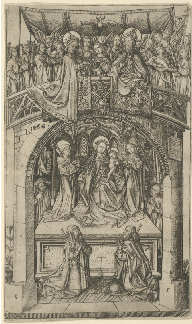
Fig. 5 Master E.S., Madonna of Einsiedeln (large version) , 1466, engraving, 209 x 125 mm. Art Institute Chicago, Chicago..