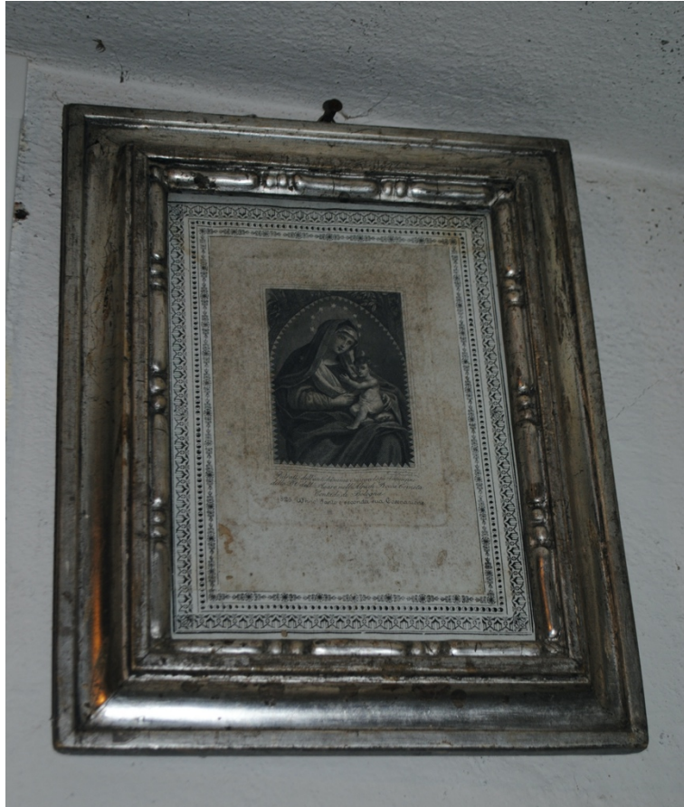
Fig. 58 Francesco Spagnoli, Madonna of the Maple , 1825, lithography. Sacristy of the Sanctuary of the Madonna of the Maple, Lizzano in Belvedere..