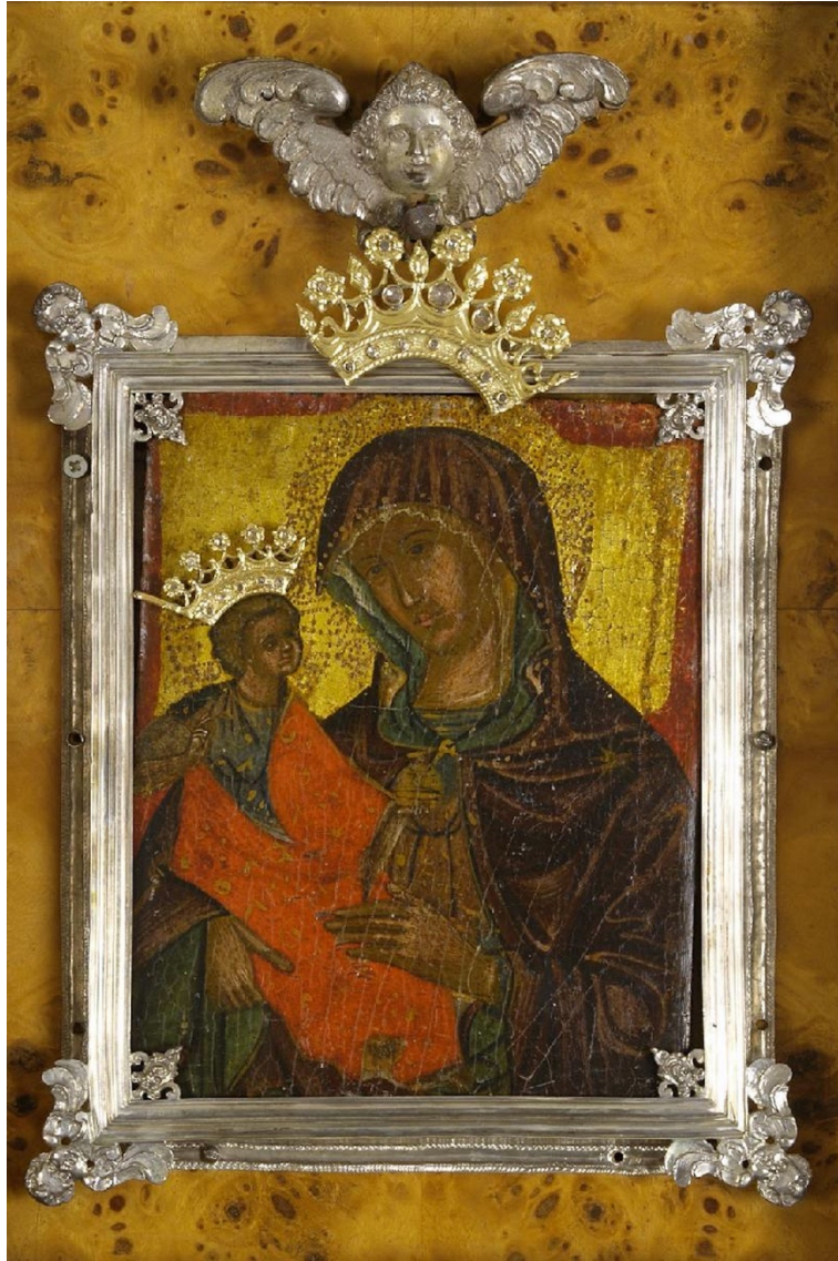
Fig. 53 Madonna of the Fire , 16th century, tempera oak panel, 215 x 170 mm. Archive of the Church of Saint Dominic, Faenza. (Photo: Storia e memoria della Bassa Romagna.).