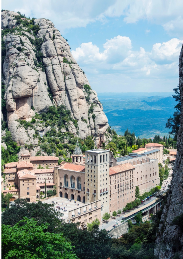
Fig. 13 Abbey of Montserrat, Monistrol de Montserrat. (Photo: Wikipedia.).