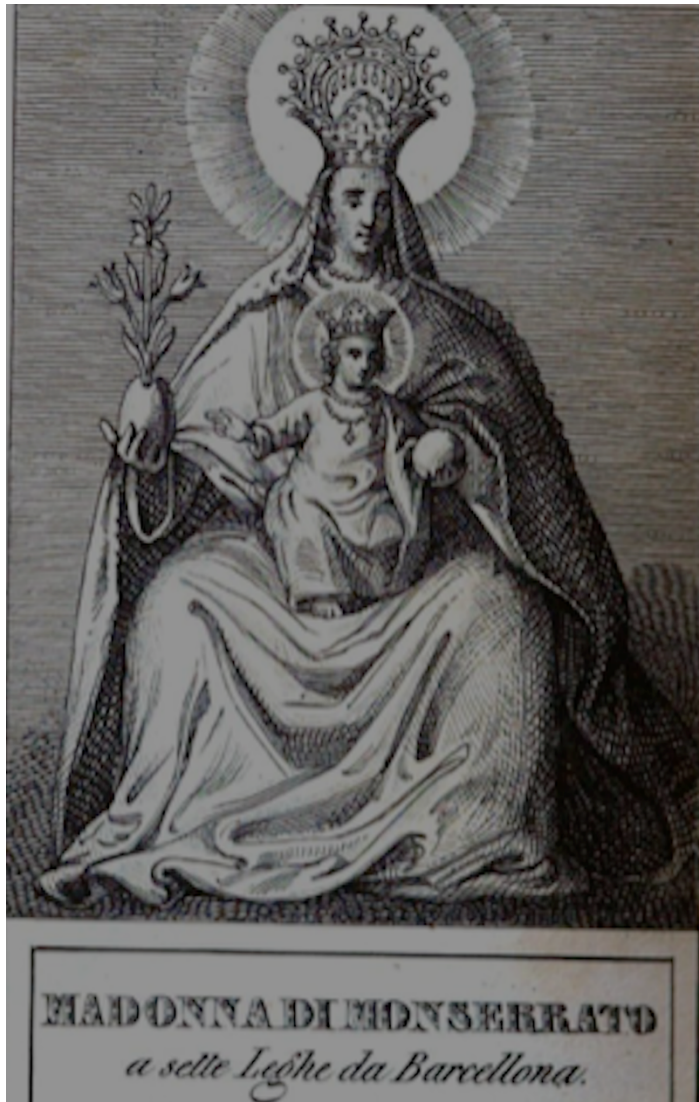
Fig. 14 Virgin of Montserrat , 1659, engraving. Atlas Marianvs . (Photo: Gumpfenberg, Wilhelm. Atlas Marianvs: sive, De imaginibus Deiparae per orbem Christianum miraculosis . Ingolstadt: Officina typographica Ioannis Ostermeyer, 1659.).