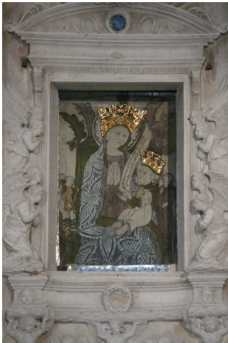
Fig. 1 White Madonna , early 15th century, coloured woodcut on parchment, 650 x 400 mm. Church of Saint Lawrence, Portovenere. (Photo: Author.).