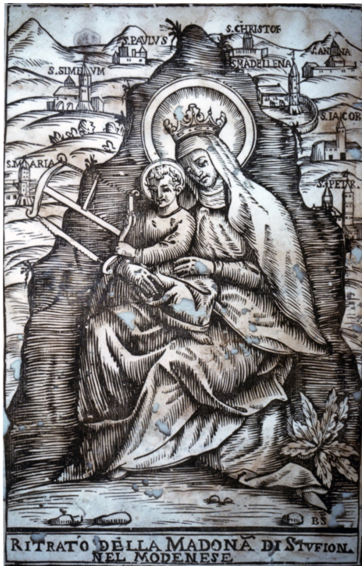
Fig. 26 BS (Bartolomeo Soliani?), Ritrato della Madonã di Stvfion. nel modenese , 17th century, woodcut, 265 x 170 mm. Fava Collection, Stuffione di Ravarino.