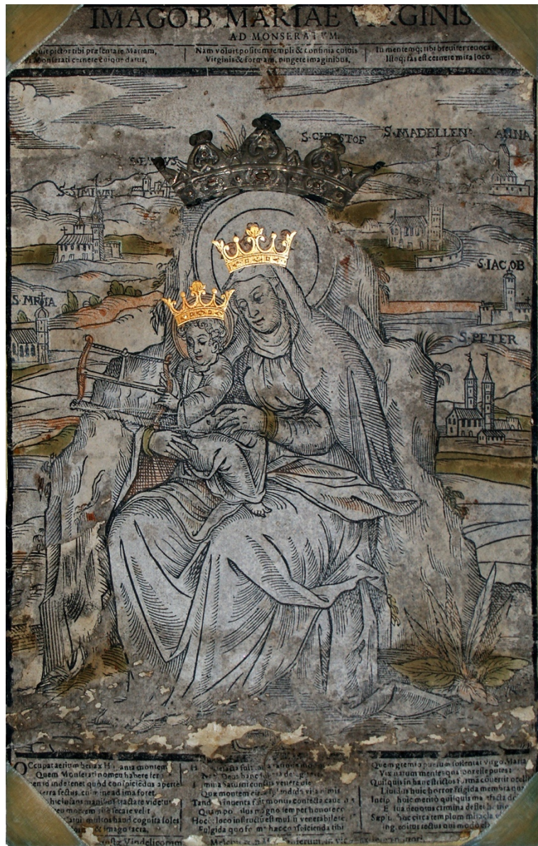
Fig. 10 Madonna of the Graces , 16th century, coloured woodcut on paper, 320 x 230 mm. Church of Stuffione di Ravarino, Stuffione di Ravarino. (Photo: Giorgio Fava.).