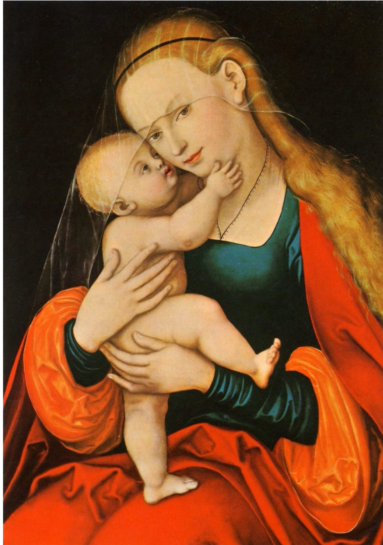
Fig. 29 Lucas Cranach the Elder, Mariahilf , about 1537, oil on panel, 850 x 600 mm. Cathedral of Innsbruck, Innsbruck. (Photo: Wikipedia.).