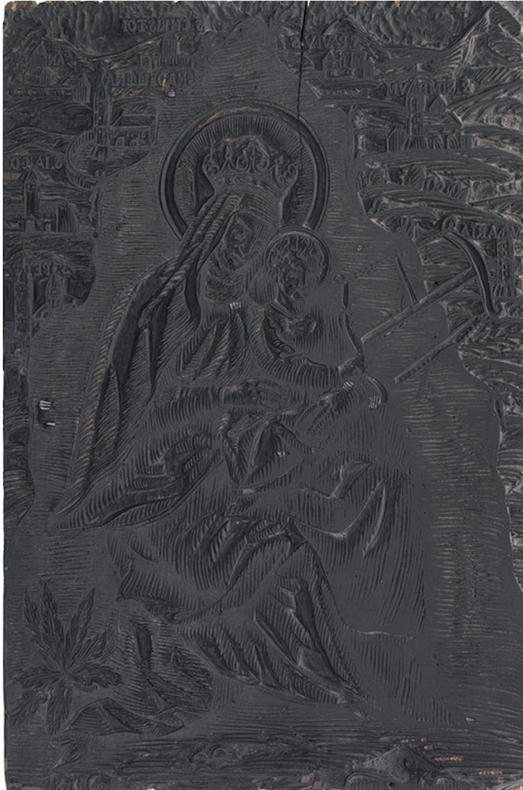
Fig. 27 Matrix of the Madonna of the Graces, 17th century, 241 x 159 mm. Fondo Soliani 4669, Galleria Estense, Modena. (Photo: Galleria Estense.).