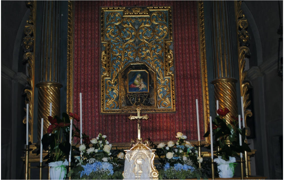
Fig. 63 Altar of the Madonna of the Maple. Sanctuary of the Madonna of the Maple, Lizzano in Belvedere. (Photo: Author.).