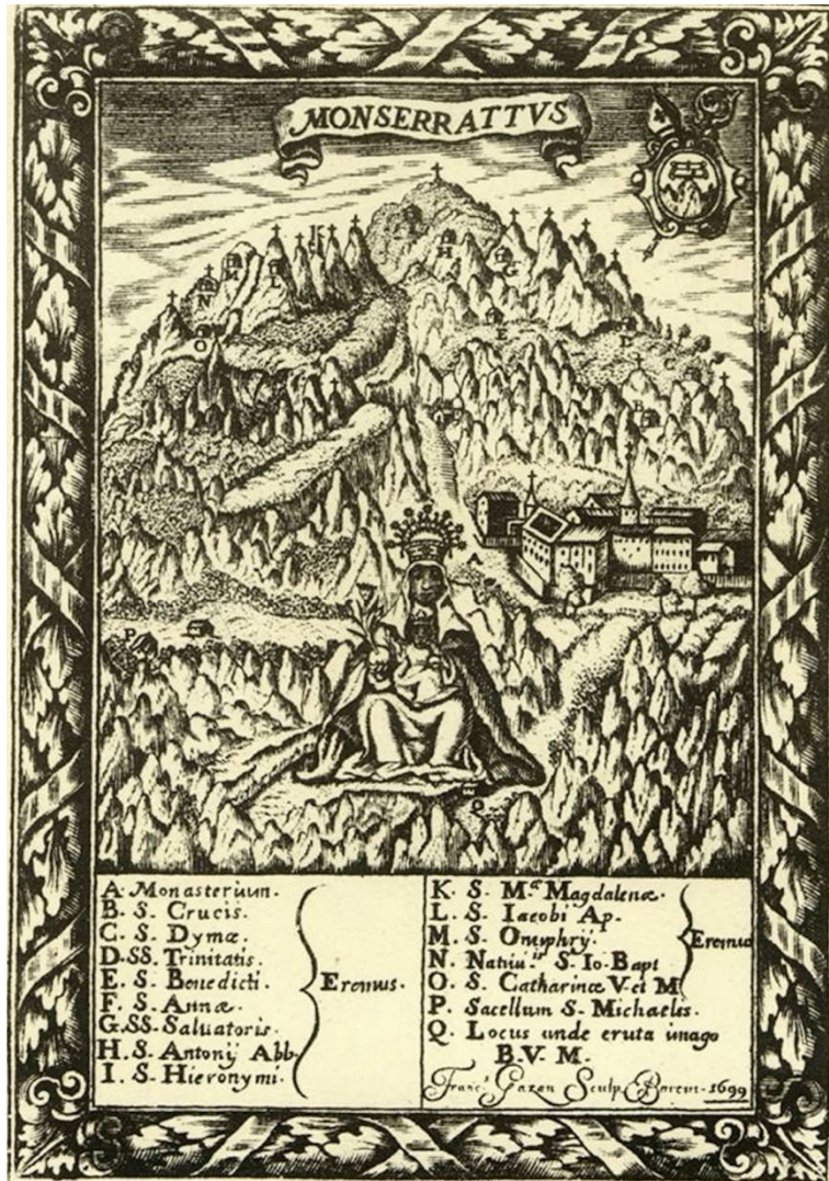
Fig. 16 Francisco Gazàn, Virgin of Montserrat , 1699, engraving, 175 x 120 mm..