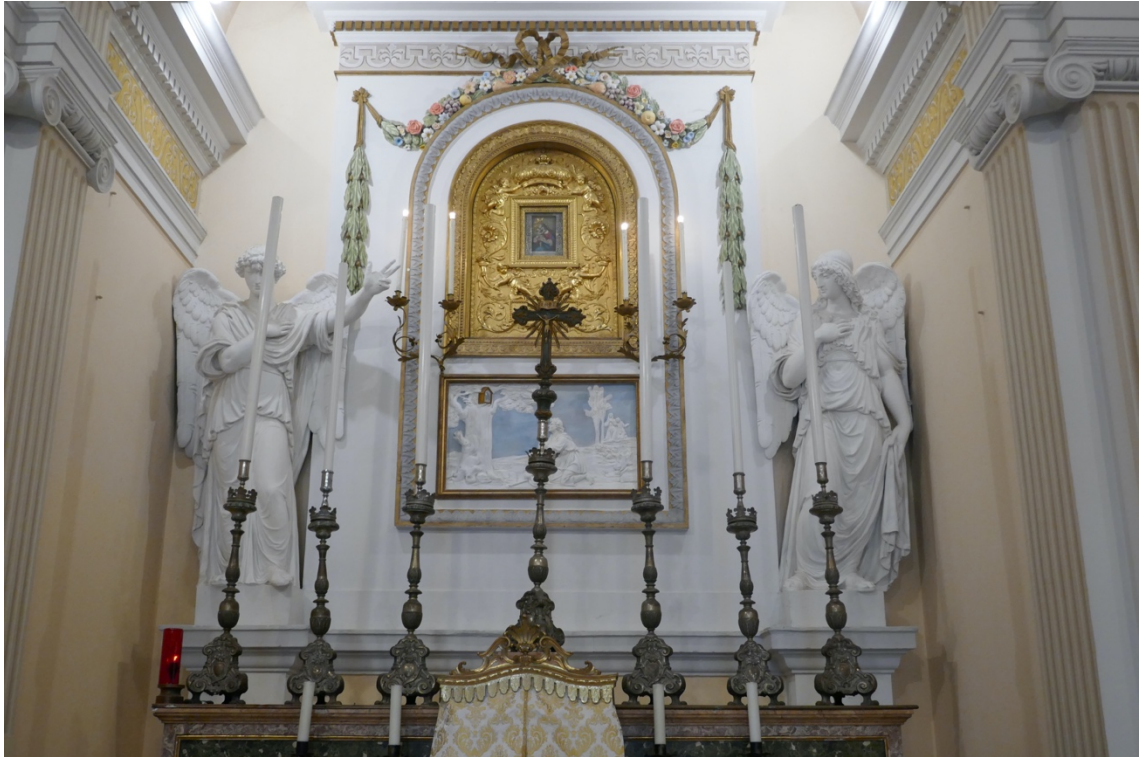
Fig. 35 Altar of the Madonna of the Graces. Church of Stuffione di Ravarino, Stuffione di Ravarino. (Photo: Author.).