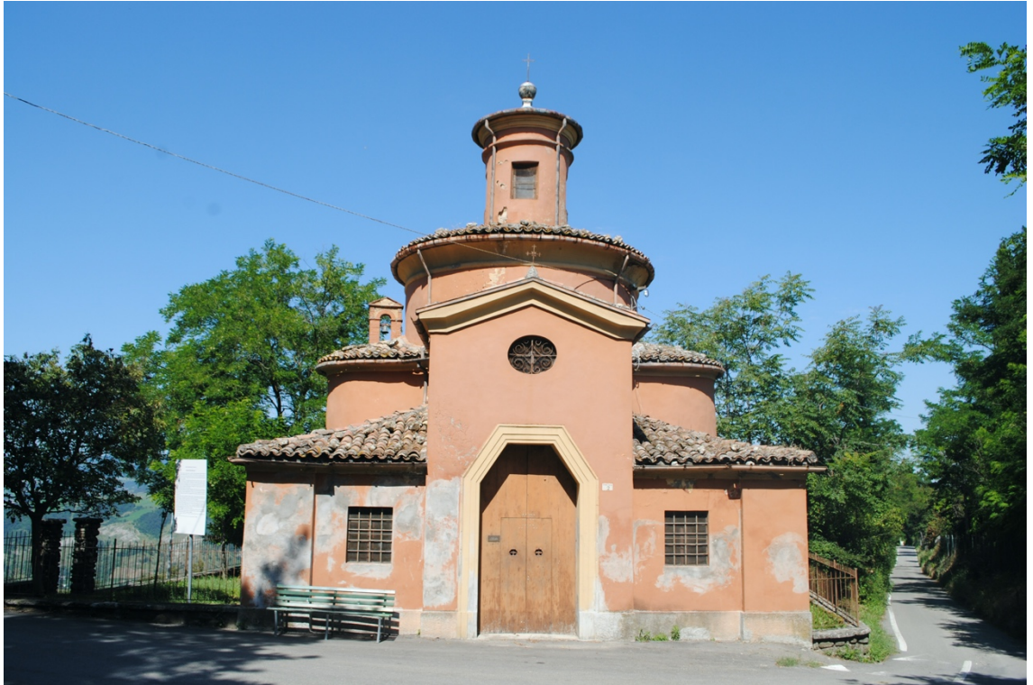
Fig. 49 Oratory of the Madonnina of Saint Luke, Guiglia. (Photo: Author.).