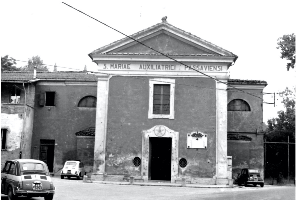
Fig. 34 Church of Pragatto in the 1960s, Pragatto. (Photo: Parish Historical Archive Crespellano Pragatto.).