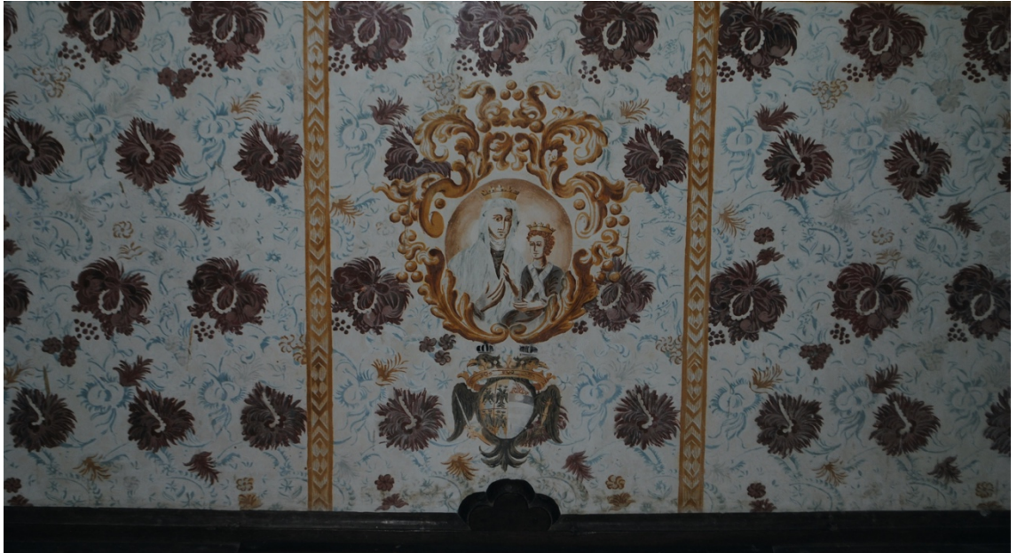
Fig. 51 Altar of the Madonnina of Saint Luke. Oratory of the Madonnina of Saint Luke, Guiglia. (Photo: Author.).