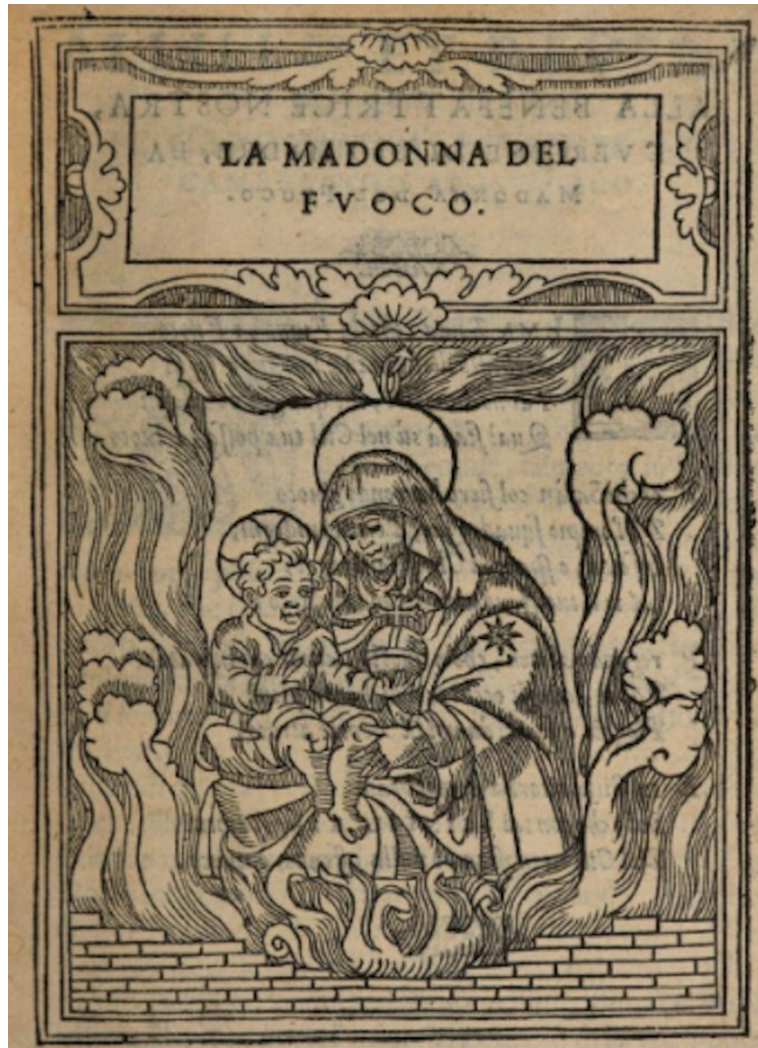
Fig. 54 Madonna of the Fire , 1569, woodcut. Scintille della Fiamma innoxia . (Photo: Capalla, Giovanni. Scintille della fiamma innoxia; cioè, Auvertimenti, e deuttioni fatte sopra il miracolo della Madonna del Fuoco, occorso in Faenza, l'anno 1567 . Bologna: Alessandro Benacci, 1569.).