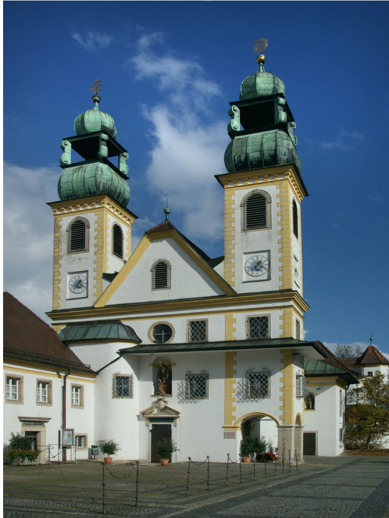
Fig. 30 Church of Mariahilf, Passau..