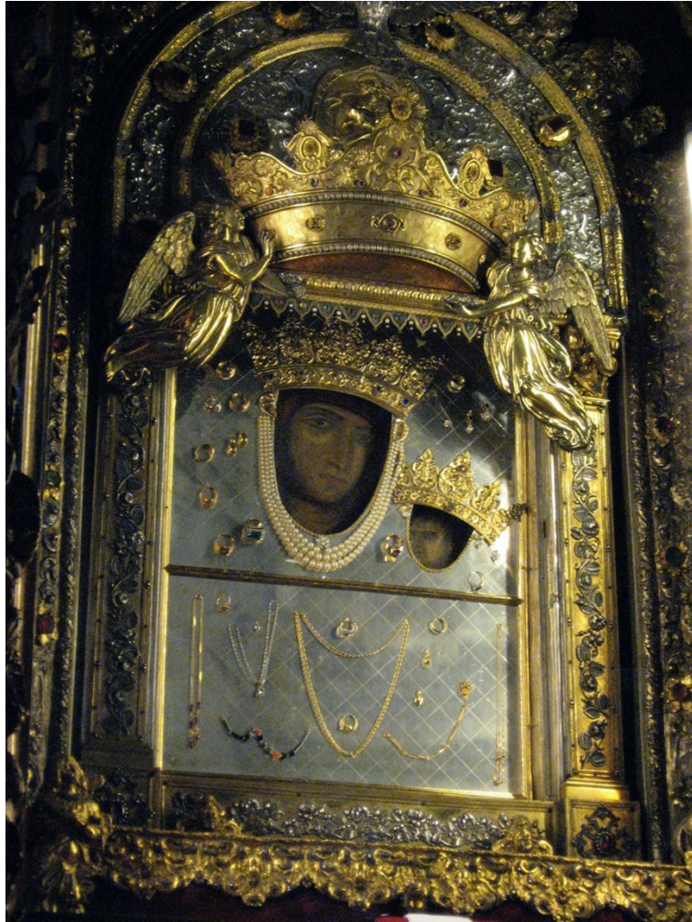
Fig. 47 Madonna of Saint Luke , late 13th century, icon, 650 x 570 mm. Sanctuary of the Madonna of Saint Luke, Bologna. (Photo: Wikipedia.).