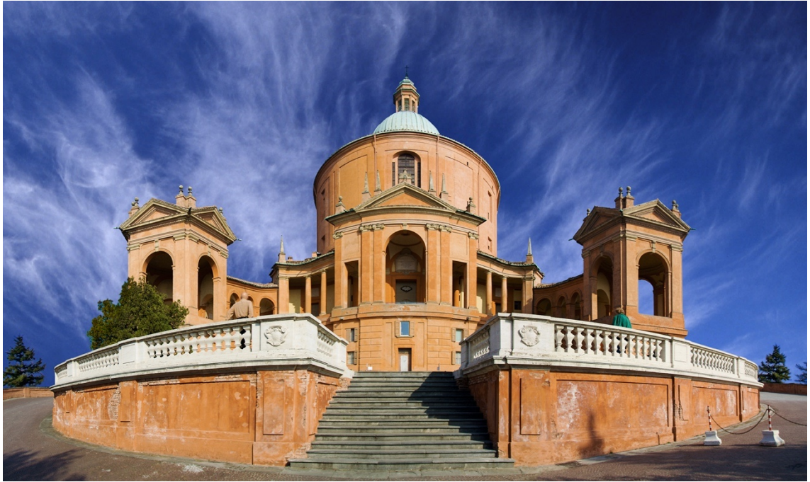
Fig. 50 Sanctuary of the Madonna of Saint Luke, Bologna. (Photo: Wikipedia.).