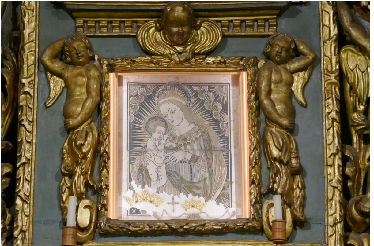
Fig. 3 Madonna of the Blood , ante 1498, coloured woodcut on paper, 375 x 345 mm. Church of Saint Mary of the Assumption, Bagno di Romagna..