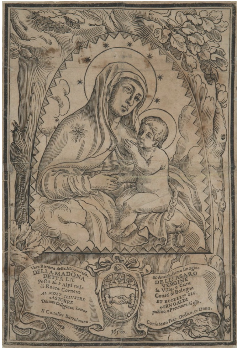
Fig. 61 Bartolomeo Coriolano, Madonna of the Maple , 1658, woodcut, 345 x 245 mm. Diocesan Museum Imola, Imola..