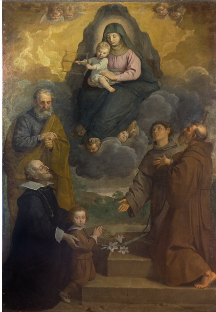
Fig. 22 Simone Cantarini, Virgin of Montserrat , early 17th century, oil on canvas, 245 x 164 mm. Nonantola's Benedictine and Diocesan Museum of Sacred Art, Nonantola. (Photo: Nonantola's Benedictine and Diocesan Museum of Sacred Art.).