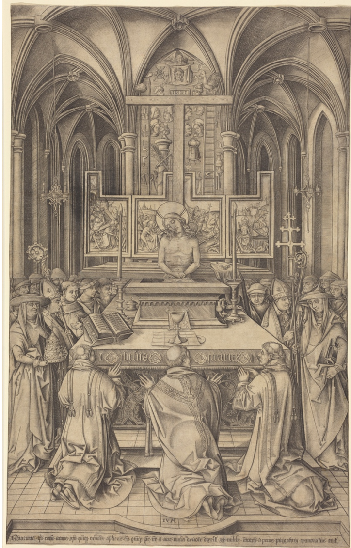
Fig. 7 Israhel van Meckenem, Mass of Saint Gregory, 1490-1500, engraving, 465 x 294 mm. National Gallery of Art, Washington.