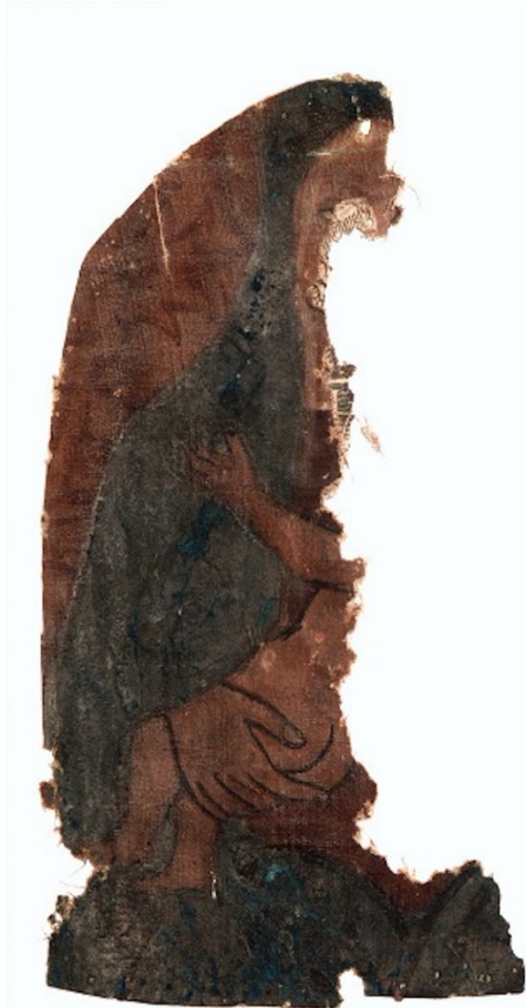
Fig. 56 Madonna of the Maple , 16th century, pencil drawing on cottonwool paper. Rectory of the Sanctuary of the Madonna of the Maple, Bologna. (Photo: BeWeb).