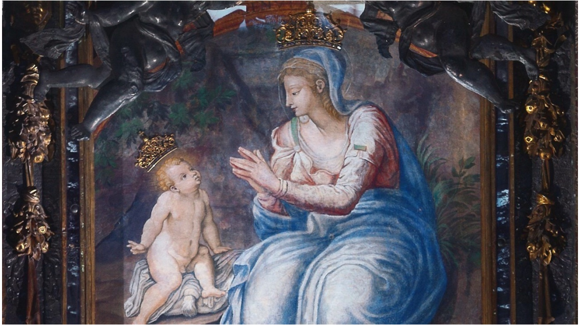
Fig. 39 Giovanni Bianco called Bertone, Madonna of the Gravel , 1573, fresco, 156 x 145 mm. Basilica of the Madonna of the Gravel, Reggio Emilia. (Photo: Website of the Sanctuary.).