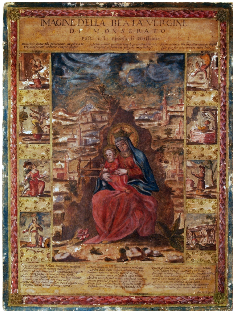
Fig. 24 Giovanni Paolo Zanardi, Immagine della Beata Vergine di Monserato Posta nella Chiesa di Stuffione , 17th century, coloured engraving, 390 x 290 mm. Church of Stuffione di Ravarino, Stuffione di Ravarino. (Photo: Giorgio Fava.).