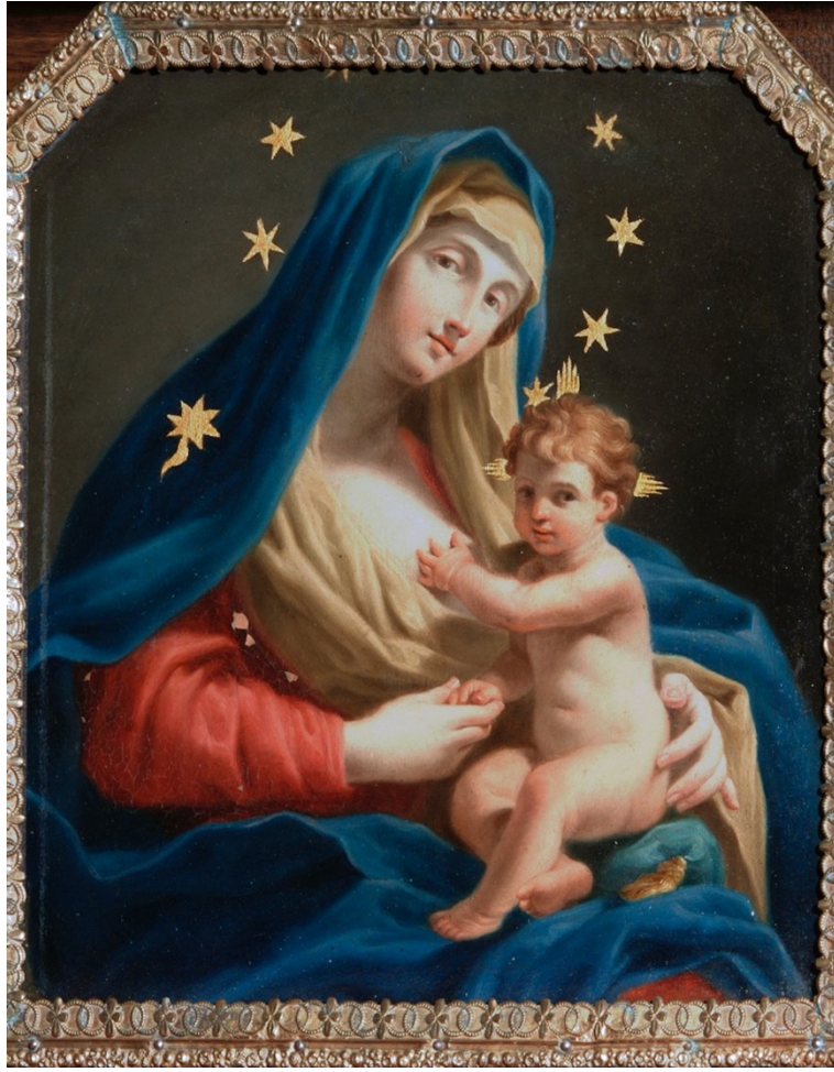
Fig. 57 Mauro Gandolfi?, Madonna of the Maple , ante 1825, copperplate painting, 280 x 260 mm. Rectory of the Sanctuary of the Madonna of the Maple, Lizzano in Belvedere. (Photo: BeWeb.).