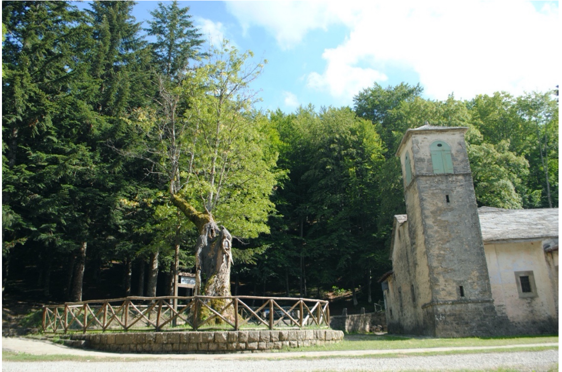
Fig. 64 Maple Tree of the Sanctuary of the Madonna of the Maple. Sanctuary of the Madonna of the Maple, Lizzano in Belvedere. (Photo: Author.).