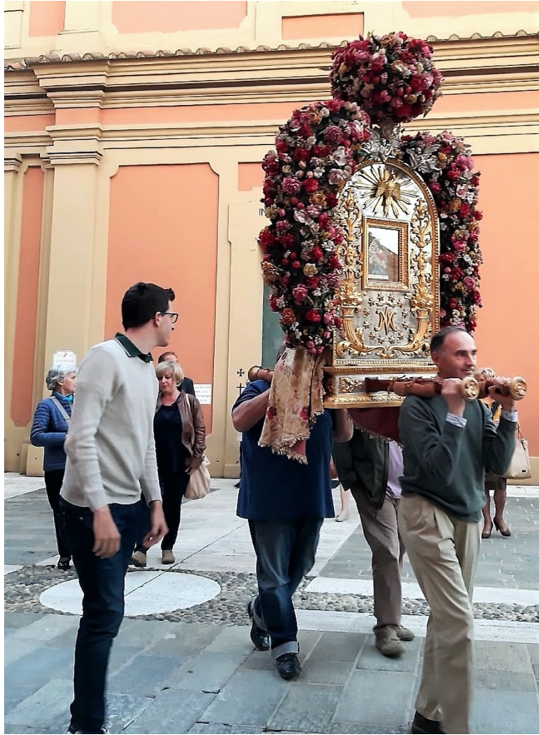
Fig. 37 Processional ark of the Madonna of Passau. Church of Pragatto, Pragatto.