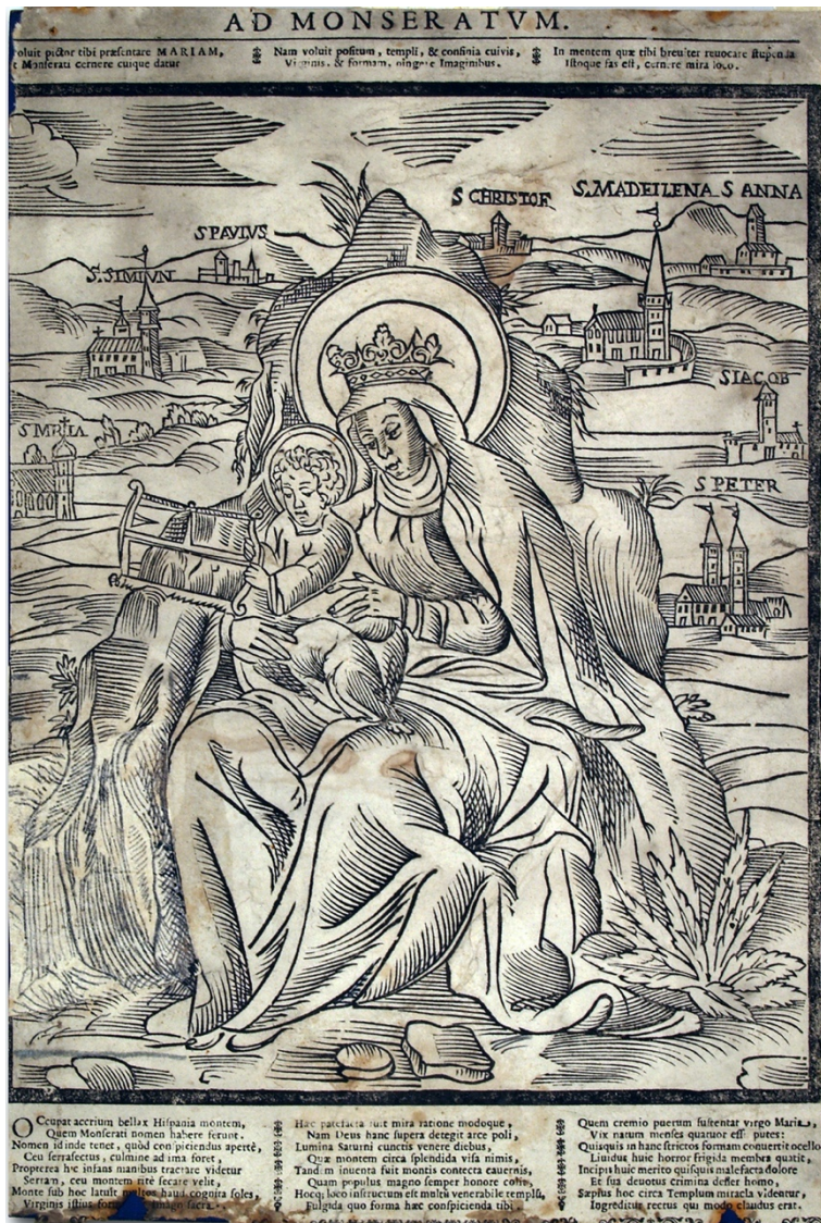
Fig. 23 Giuliano Cassiani, Madonna of the Graces , 17th century, woodcut, 345 x 235 mm. Church of Stuffione di Ravarino, Stuffione di Ravarino.