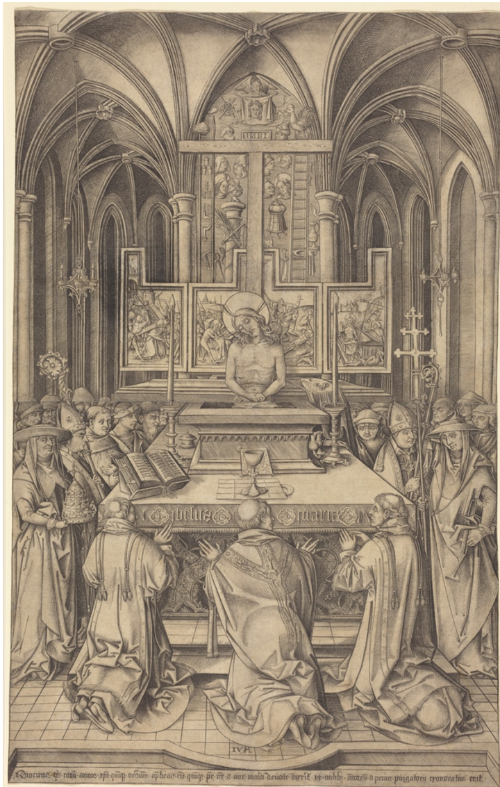
Fig. 7). 60

A metalcut of St Jerome and the Lion , pasted in a late fifteenth-century book of exorcism that at one point belonged to the Carmelite Monastery of Frankfurt, reports in erroneous Latin: 'Possit non eiciam [sic] picture demon ut nullus apparere suo tato / temuit [?] ipse pauore. Obiectum [sic] fuerit nam si quod demone corpus / hunc mox in tuitus [sic] depellet ymage [sic] alme.' ('No demon can appear before this picture or it will be filled with fear. If a