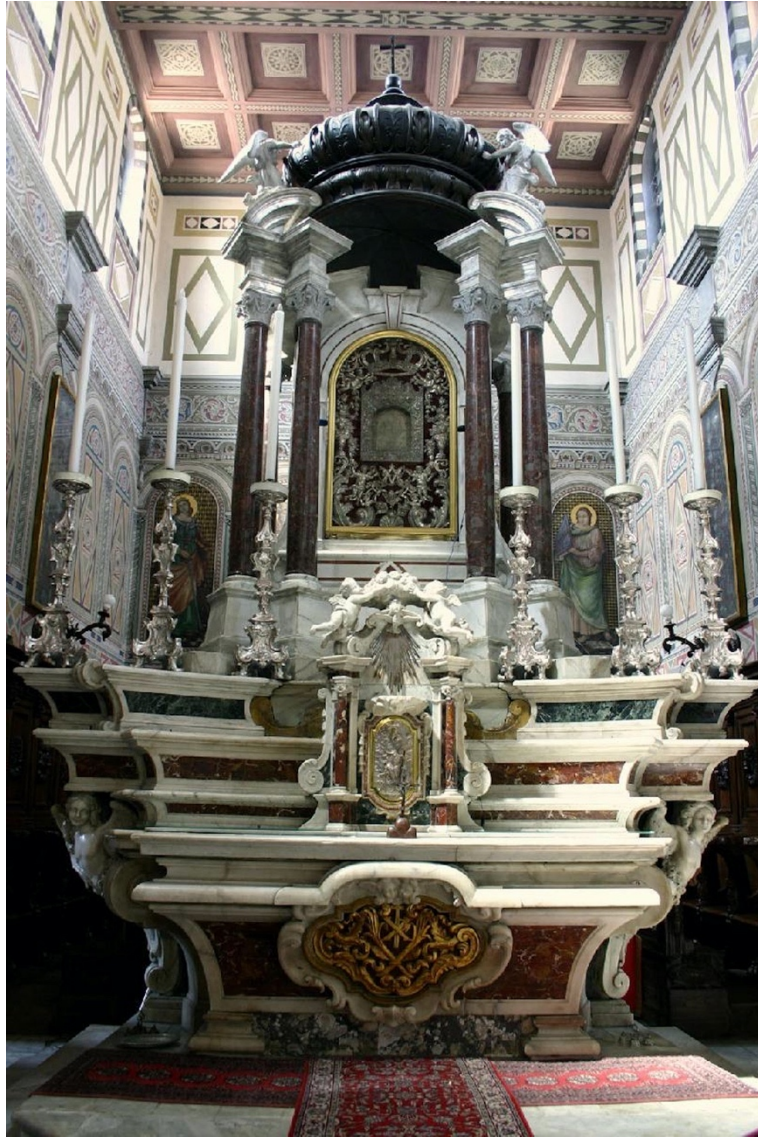
Fig. 46 Altar of the Blessed Virgin of the Adoration. Church of Saints Jacopo and Anthony, Fivizzano. (Photo: BeWeb.).