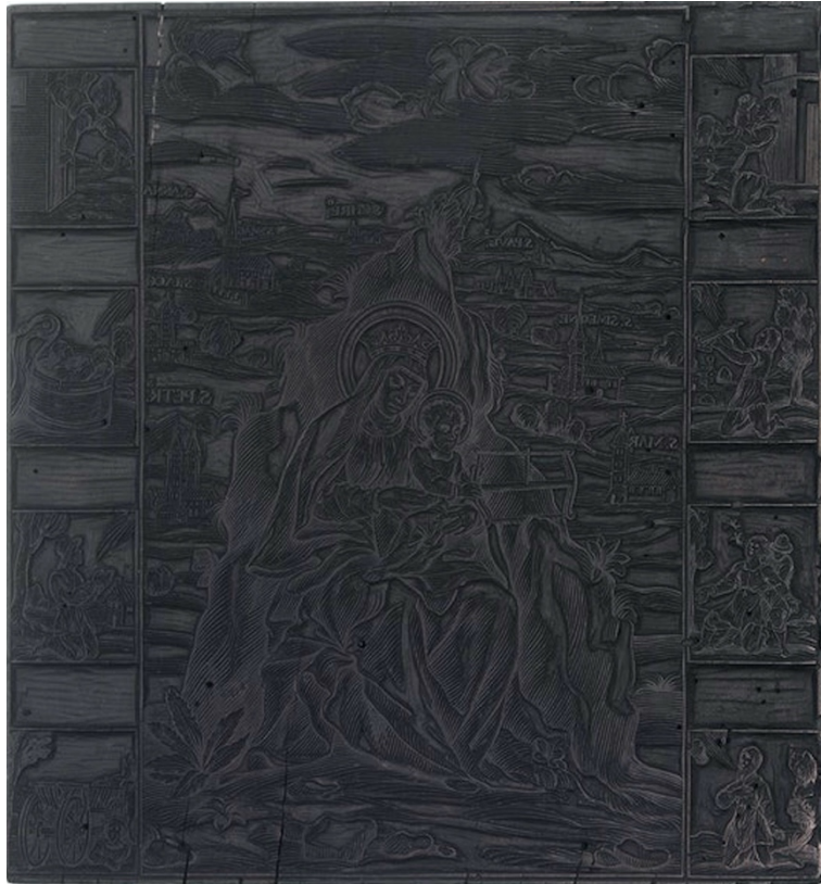
Fig. 25 Matrix of the Madonna of the Graces, 17th century, 293 x 271 mm. Fondo Soliani 4582, Galleria Estense, Modena.