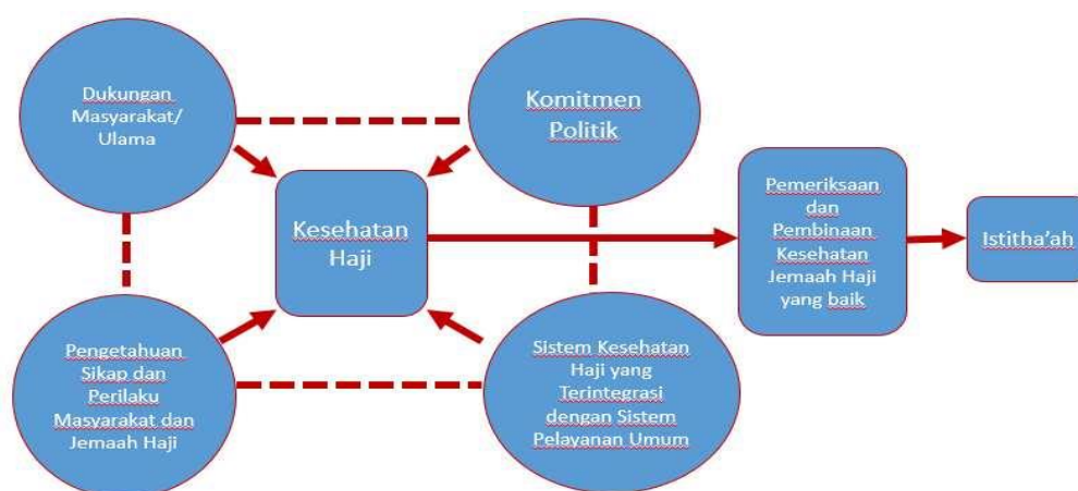
Figure 2Hajj with the concept of four pillars

Minister of Health Regulation No. 15/2016 on Health Istitha'ah has created the Hajj Health Center in collaboration with the Ministry of Religious Affairs since the implementation of the 2017 Hajj with the concept of four pillars described as follows: