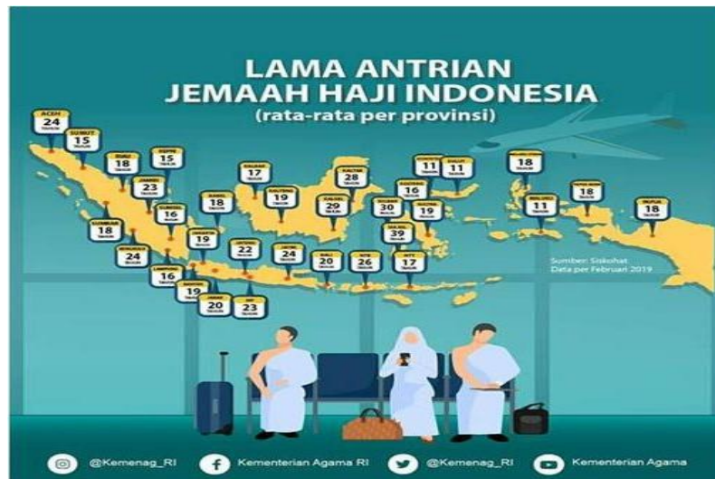
Figure 3 Queue for Indonesian Hajj pilgrims

Data compiled by the Ministry of Religious Affairs related to the provincial area zone and the duration of the waiting period for prospective Hajj pilgrims as of February 2019: