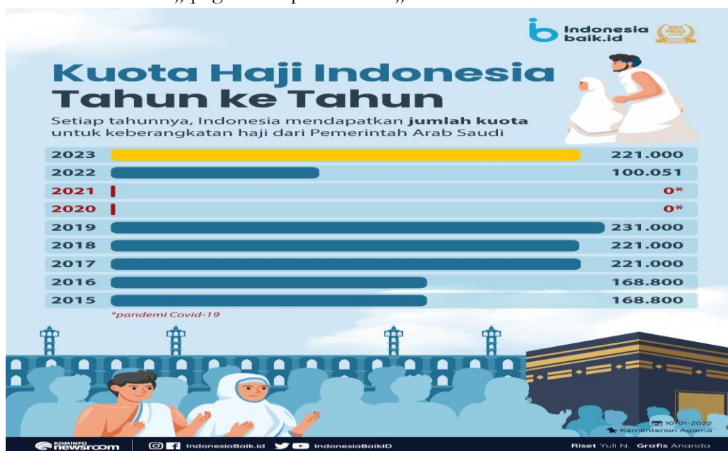
Figure 4 Indonesia's Hajj Quotas 2015-2023

While the comparison of the Hajj quota in the last eight years shows that the quota of 221,000 pilgrims in 2017-2018 given by the Government of Saudi Arabia to Indonesia is constant at the exact figure even until 2023, so it is not able to reduce the waiting list for the departure of prospective Indonesian Hajj pilgrims to perform Hajj.