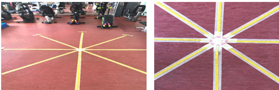
Fig. 2. SEBT, lines drawn on the ground