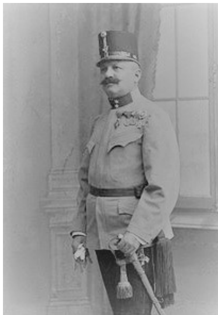
Anton Norst: portrait 4

Anton Norst (1859-1939) – journalist, writer and publisher of the newspapers “Czernowitzer Zeitung” (“Chernivtsi Newspaper”), “Im Buchenwald und Czernowitzer Gemeindezeitung” (“In Buchenwald and Chernivtsi Public Newspaper”).