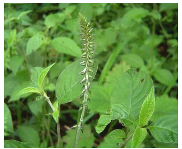
Fig:1 Plant of Achyranthes aspera