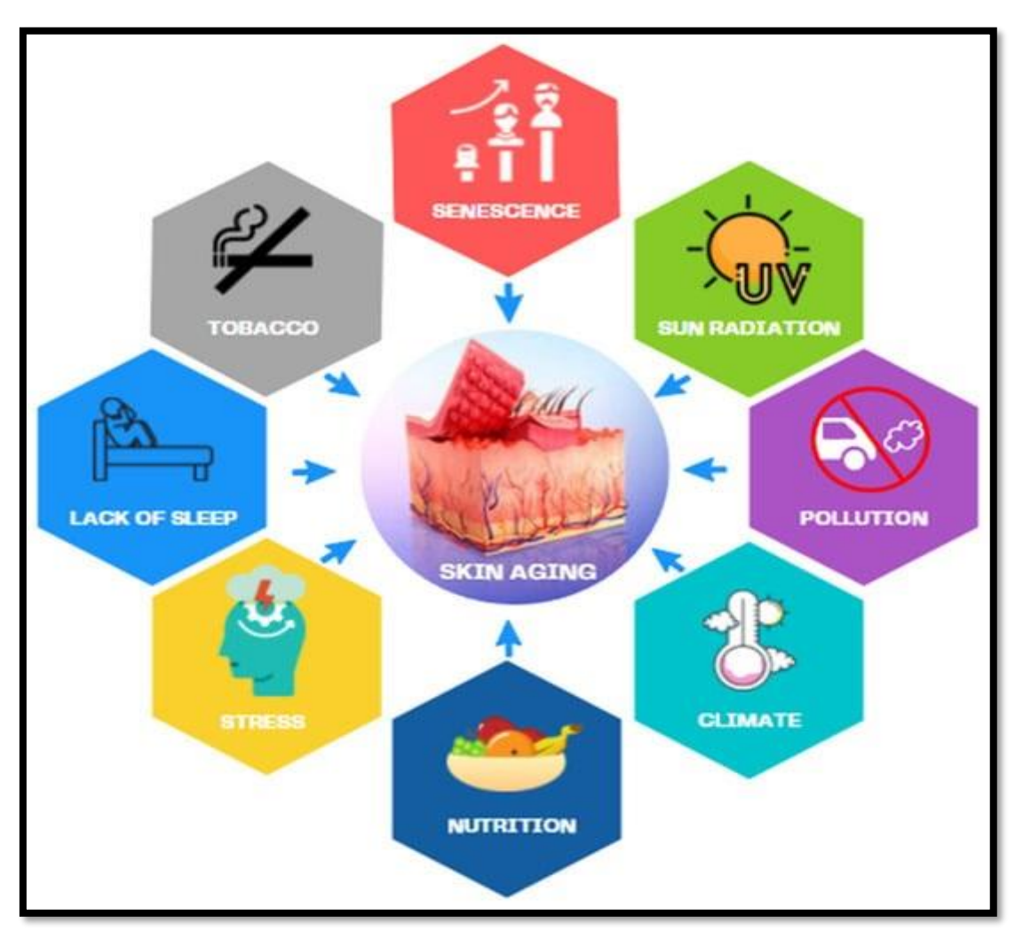
Figure 2: Skin ageing factor

water loss (TEWL) probe to assess the skin's barrier function [127].