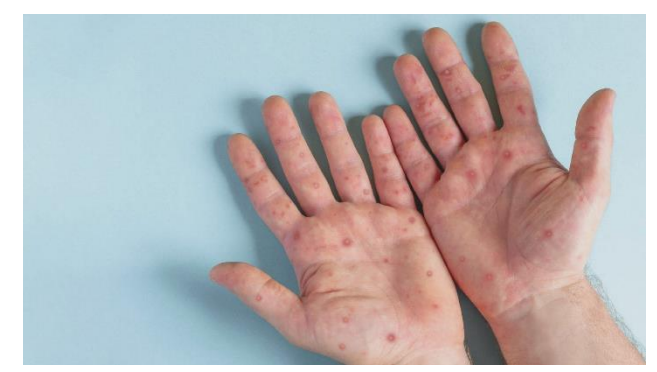
Figure 3: Monkeypox signs and symptoms

A study done in 2004 found similar results. Headache and skin lesions were present in 100% of patients while 82% of patients reported fever, sweating, and chills[18]. Coughing was reported by 73% of patients, lymphadenopathy was reported by 55% of patients and 18% patients reported malaise[19]. Blepharitis, nausea, nasal congestion, back pain, and myalgias were reported in only 9% cases. Another study concluded that nausea, vomiting, and mouth sore were independently associated with hospitalization duration of more than 48 hours[20].