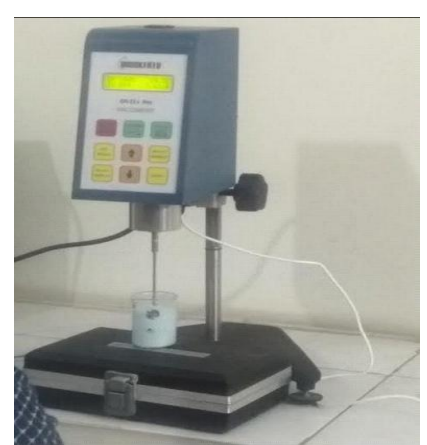
Figure 2: viscosity of herbal shampoo by Brookfield viscometer.

favorable property which eases the spreading of the shampoos on hair. The low range of rpm set was 6RPM and high rate of 12RPM(Singh et. al 2014).