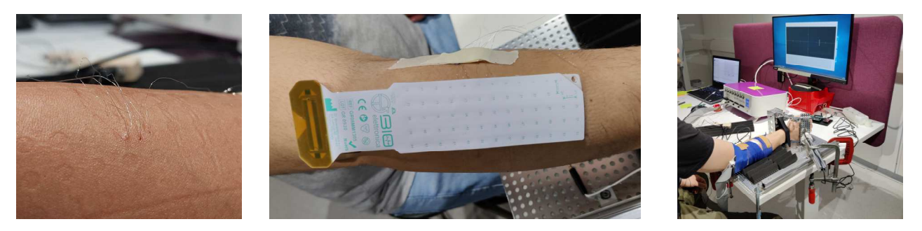
Figure 1: (Left) Three fine-wire electrode pairs inserted into the subject's ECRB. (Middle) A 64-channel high-density electrode matrix placed on top of the subject's ECRB and centered above the fine-wire insertion points. (Right) Experimental setup: rig for measurement of isometric wrist extension forces and a display for force feedback and experimental prompting.