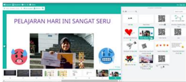
Figure 2 – Student Opinions on Learning Using Whiteboard

Teachers can also directly monitor students' use of Whiteboard. This aligns with [5] assertion that a significant advantage for teachers using Whiteboard is the ability to track all students' work simultaneously. Based on this data, in addition to presenting visually appealing features that support learning, the features on the Whiteboard are also easily accessible to students.