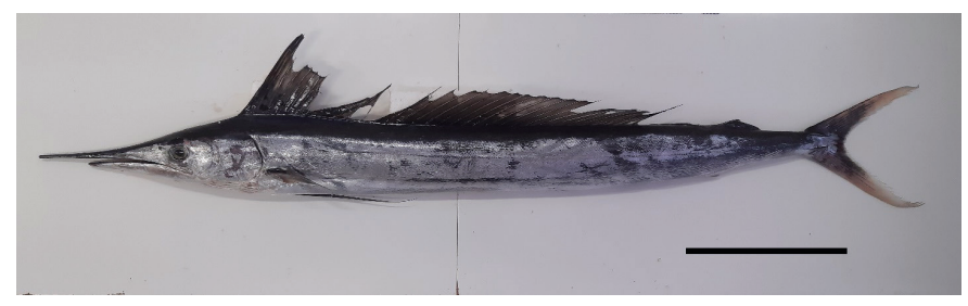
Fig. 2 - Specimen of Tetrapturus belone caught south of Banias city, (ref. MSL 17/2022) with scale bar = 200mm.

pressed, bill rather short and slender, round in cross section; nape almost straight; right and left branchiostegal membranes completely united to each other, but free from isthmus, no gillrakers, both jaws and palatines (roof of mouth) with small, file-like teeth, two dorsal fins, first dorsal fin base long, extending from above posterior margin of preopercle to just in front of second dorsal fin origin; second dorsal fin with 6 rays; two anal fins, the second very similar in size and shape to the second dorsal fin; pectoral fins short, adpressible against sides of body, their upper margins curved, lower margins nearly straight and tips pointed, pelvic fins long and slender, slightly shorter than twice the pectoral fin length and depressible into deep ventral grooves, caudal peduncle well compressed laterally and slightly depressed dorsoventrally, with strong double keels on each side and a shallow notch on both, the dorsal and ventral surfaces; anus located far anterior to first anal fin origin, lateral line single and obvious, colour of the body dark bluish grey to nearly black dorsally and silvery white ventrally (Fig. 2).