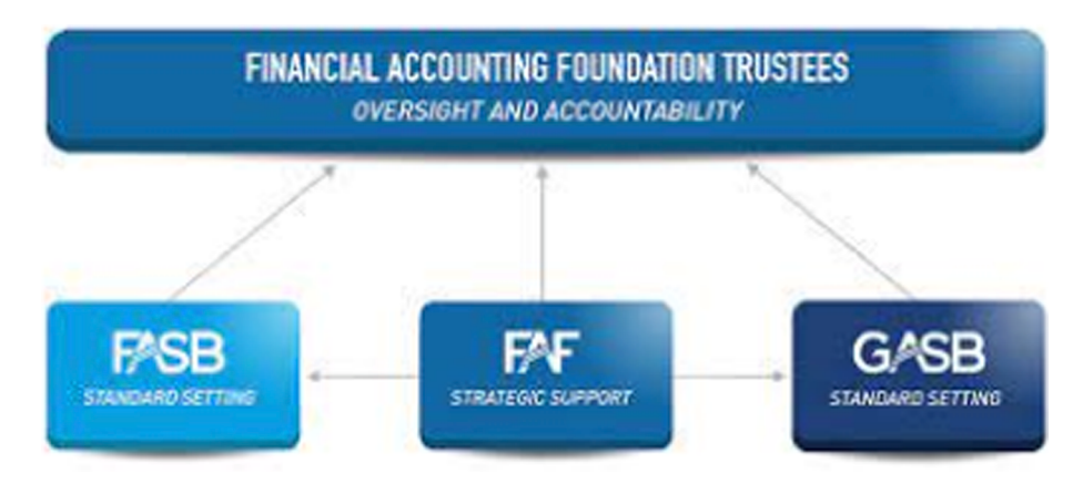
Fig. 1. FAF ORGANIZATIONAL HIERARCHY CHART. The figure above is an image from the Financial Accounting Foundation website that depicts its hierarchy (FAF 2021a).