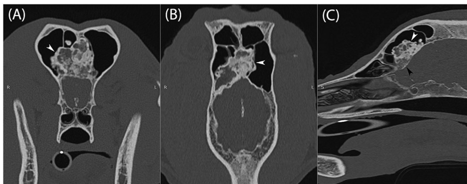
FIGURE 2 Transverse (A), dorsal (B), and sagittal (C) bone-window survey CT images showing a large, well-defined, heterogeneously mineral attenuating, lobulated frontal sinus mass (white arrow). Mild ventral and caudal displacement of the underlying calvarium is seen (black arrow). A, B, Left is to the right of the image.

One month after the CT, the patient was anesthetized and the mass was surgically debulked using a frontal sinusotomy approach (Figure 3). Complete resection was not possible due to involvement of the rostral calvarium and cribriform plate. The patient recovered uneventfully. A piece of frontal bone with adherent mass and some central mass bone fragments were submitted for histopathological analysis. Fresh samples submitted for bacterial and fungal culture, were negative.