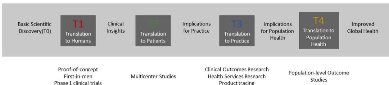
Figure 1. The process of translational research from basic scientific discovery to translation to population health [6].