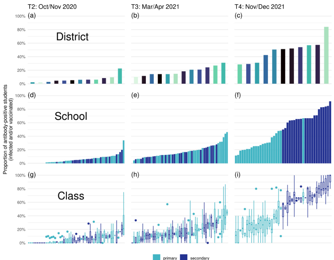
Figure 1: Proportion of ever-seropositive children in the canton of Zurich among districts (upper), schools (middle) and classes (lower) at T2 (October-November 2020), T3 (March-April 2021) and T4 (November-December 2021). Each district has an individual colour in the upper panels, primary school children (grades 2-6) in light blue and secondary school children in dark blue (medium and lower panels). Boxplots in the lower panels denote median and describe variability of seroprevalence on a school level expressed as maximum seroprevalence in a class minus minimum seroprevalence and summarised as median (interquartile range). Whiskers of boxplots denote \pm 1.5 standard deviation (SD). Proportion of ever-seropositive children in the canton of Zurich among districts (upper), schools (middle) and classes (lower) at T2 (October-November 2020), T3 (March-April 2021) and T4 (November-December 2021). Each district has an individual colour in the upper panels, primary school children (grades 2-6) in light blue and secondary school children in dark blue (medium and lower panels). Boxplots in the lower panels denote median and describe variability of seroprevalence on a school level expressed as maximum seroprevalence in a class minus minimum seroprevalence and summarised as median (interquartile range). Whiskers of boxplots denote \pm 1.5 standard deviation (SD).

had a higher seroprevalence (19.5%, 95% CrI 16.0-23.7%) than secondary school children (15.1%, 95% CrI 10.7-19.6). At T4, when only children with SARS-CoV-2 antibodies due to infection were counted and vaccinated subjects excluded, primary students had lower seroprevalence than secondary school students (28.7% vs 41.0%).