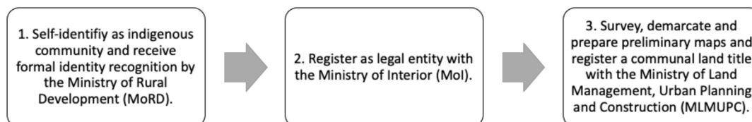
Figure 2. Cambodia Indigenous collective land titling timeline as presented to Bunong communities.

We suggest that the timelines of facilitated privatization and concessions interfere with Indigenous collective land title, where the timeline to achieving Indigenous land title needs to be seen as “uneven”. Hence, during the protracted struggles for land, some opportunities to title may be closed, while new options appear [53]. Drawing on Lefebvre [54], rather than a continuous speeding up of a “modern” neutral state process, we can see that the rhythms of the titling processes stop, stutter, loop, accelerate or may not be achieved at all. In sum, it is important to consider the temporality and pace of land titling as lived by Indigenous people, through the lens of disjointed timelines, both socially and materially.