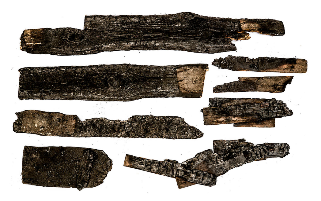
Figure 3. S moldered planks from a demolished Jewish house in Biłgoraj.

tombstones converted after the war into grindstones. A similar practice exists in rural Poland, too, where small items from Jewish households are being offered on sale to Jewish tourists.<sup>71</sup>