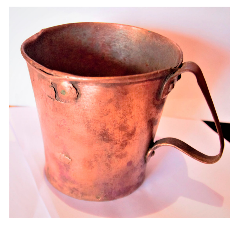
Figure 1. A repurposed Jewish ritual washing cup on sale at the local souvenir shop in Mir, 2022.

was the melody of 'So speaketh Abaji and Raba' emanating from these pages. I left, threw away the butter, and pocketed the sacred piece of text. ^{51}