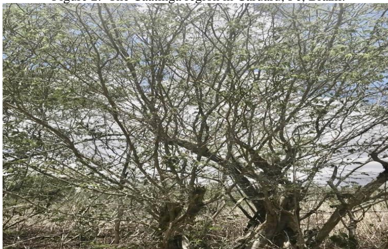
Figure 2. The Caatinga region in Caruaru, Pe, Brazil.