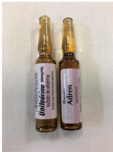
Figure 2: from September 30 th , 2003 (Federal documents - DOU October 1 st , 2003).

According to the National Agency for Sanitary Surveillance (ANVISA) Medicines Labeling Regulation 16 , parenteral solutions, families of similar medicines should be of the same label color, this color being pre-established in a specific annex. It is, however, clear that medications with different potencies and similar names, such as Ephedrine and Epinephrine (Figure 2), may be confounding factors. It can still be mentioned the fact that there is nothing on the form of ampoules, but drugs of quite different potencies, but from the same family have the same color of the label and the same ampoule format, these factors being confusing, especially in situations of urgency .