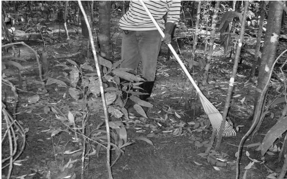
Figure 1. Removal procedure of deposited litter, in the litter removal plot in a secondary forest, Castanhal/PA.

Samples of fractions of the biogeochemical matrix were classified as: i) non-woody (leaf, flower, seed, fruit and miscellaneous) and ii) woody > 3 cm (branches). The plant materials collected in each litter collector were dried in the laboratory at 60-70 °C for 48 hours and weighed. At four-week intervals, materials from the same collector were mixed and then separated into woody and non-woody fractions.