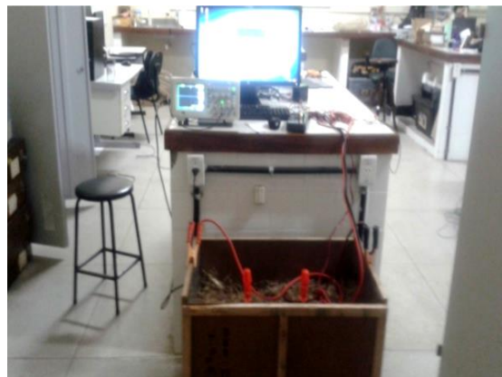
Figure 1. Box containing soil samples and connectors.

As shown in Figure 1, the electrodes were placed on the blades or plates. The box has dimensions of 0.70 m in length, 0.50 m in width and 0,40 m in height. The voltage source used was a 60 Hz alternating voltage source, as well as multi-testers and oscilloscopes, for the measurement of current, frequency and resistance values.