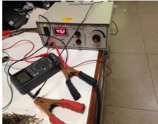
Figure 2. Image of the experiment using an AC source.

Figure 2 shows the image of an alternating voltage source, often at 60 Hz, used in this experiment.