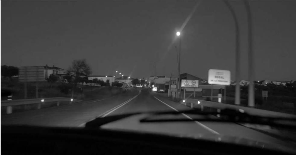
Figure 2 – Border lexicon.