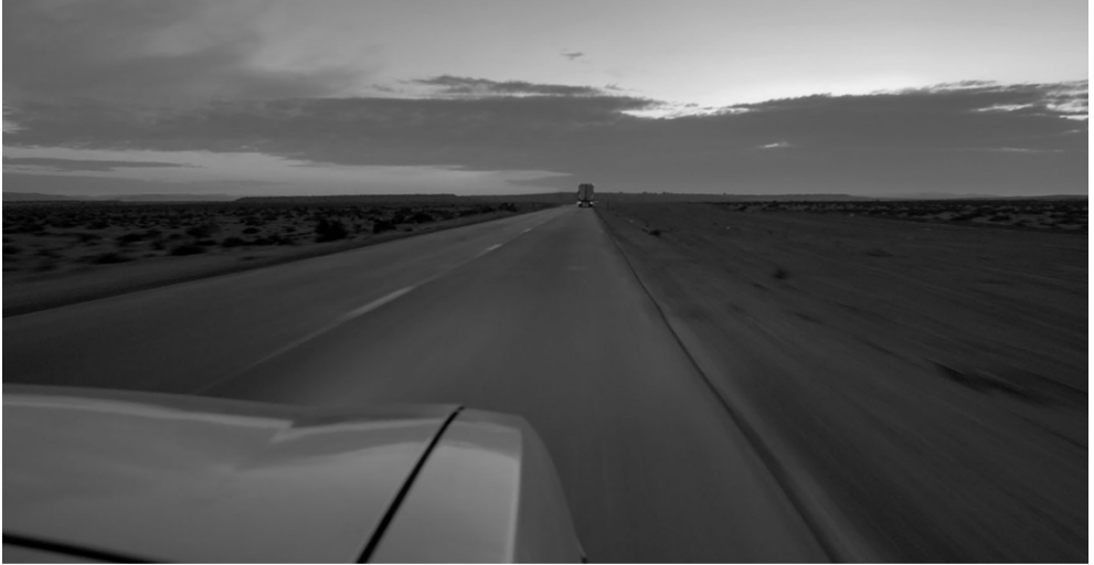
Figure 5 – Invisible lines.