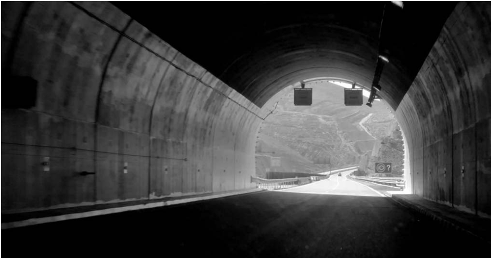
Figure 4 – Mnemonic border.