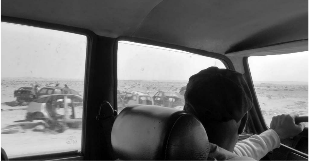
Figure 7 – “Kandahar”.