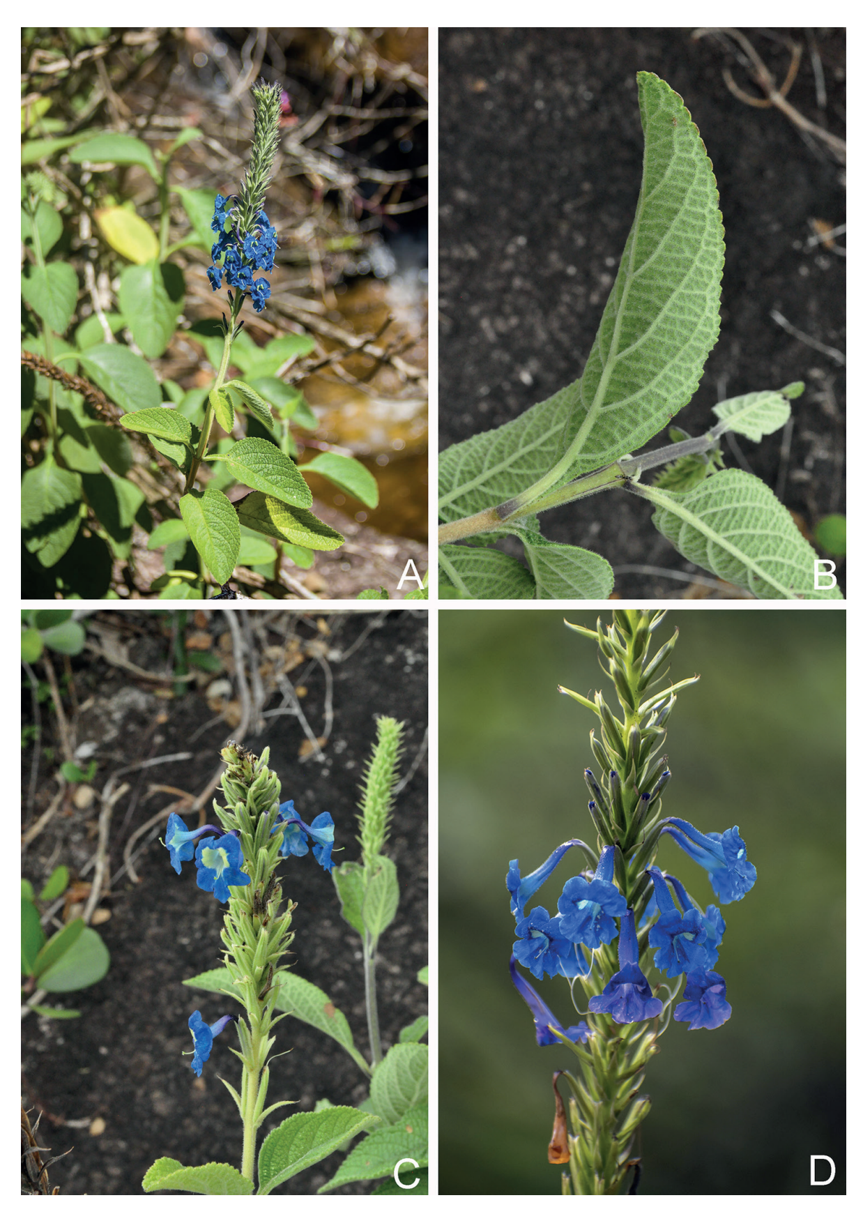
Figure 1. Stachytarpheta sprucei. A - habit. B - Leaf, abaxial surface. C, D - Details of the inflorescences showing flowers and buds. A, B and C from inselbergs of Minas Gerais, Brazil. D. from an inselberg of Guyana.