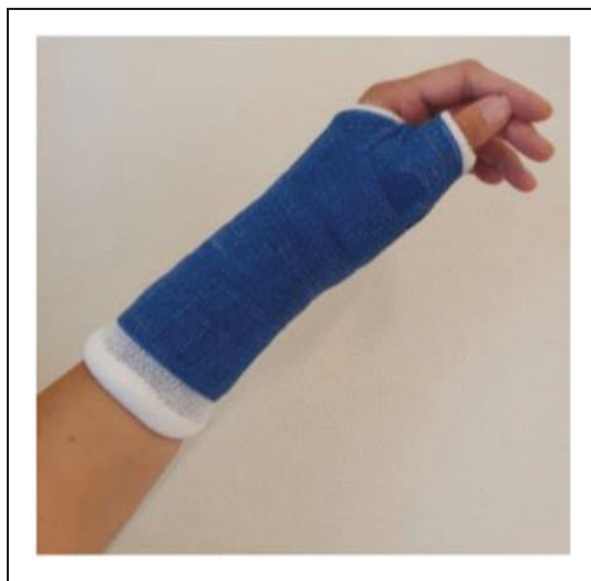
Figure 1. Cast immobilization.

clinical experience using a standard protocol (Appendix SI, available online).