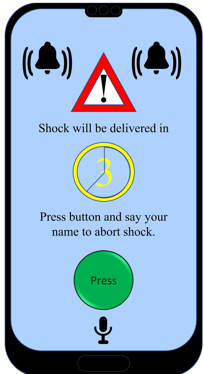
Figure 1 A hypothetical screen design of the proposed patient confirmation mobile application.

A thus far unexplored strategy concerns patient confirmation through a mobile application. Mobile phones and smartwatches have become commonplace. This brings opportunities for health advancement. Mobile applications are already used in cardiac care. They have been found to be useful for several different patient populations, for instance for home-based cardiac rehabilitation via a smartphone in post-myocardial infarction patients, 14 and for telemonitoring in patients with heart failure, 15 with smartwatches and a mobile application being used in the detection