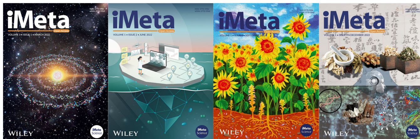
FIGURE 1 Brief introduction of covers from 2022 issues. Issue 1: The galaxy represents the complexity and value of bioinformatics and metagenomics. DNA, which represents genetic components that guide biological diversity, is at the center of the galaxy. The spiral arms are the microbiome welcoming scientists from all over the world to make novel discoveries. Let us usher in the metaverse era of the microbiome. Issue 2: iMetaLab, a metaproteomics platform from Daniel Figey's group. The figure represents the visualization of big data mining from the ocean of microbiomes. The implication is that various omics in microbiome research can develop useful and easy-to-use analysis tools, and create high-quality analysis platforms as an infrastructure. Issue 3: Sunflower Orobanche Microbiome, sunflower-microbe interaction in the prevention and control of Orobanche parasitism by a team of Academicians James M. Tiedje and Yanbing Lin. The style of painting pays homage to Van Gogh's sunflower, the masterpiece of Impressionism, and research on plant microbiome, which represents vitality, flourish, and the sustainable development of agriculture. Issue 4: TCM-Suite, a digital analysis platform for traditional Chinese medicine identification and pharmacology network research from Kang Ning's group. The cover reflects the collision and integration of traditional Chinese medicine knowledge and modern omics data under the blessing of artificial intelligence and represents the new vitality of traditional Chinese medicine with the help of modern technologies.

According to Wiley ( https://insights.wiley.com/ ), publications of iMeta display board interest of audiences, attracting 115,809 downloads from 165 countries and regions in 2022 (Figure 2B, Supporting Information: Table S1). Notably, a single publication “Complex heatmap visualization” [5] has been downloaded 11,537 times in 2022 (Supporting Information: Table S2).