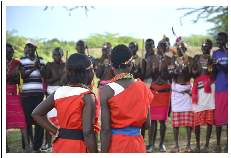
Figure 3. Dancing at a ceremony. Baringo County, Kenya, August 2019.