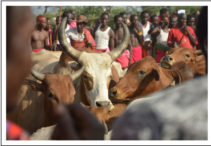
Figure 1. Morans and elders gather around cattle in preparation for a ceremony. Baringo County, Kenya, August 2019.