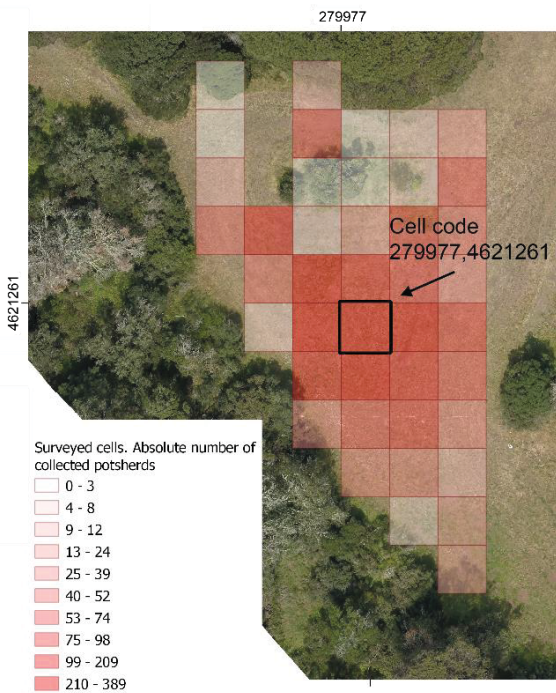
Figure 3. Cell code assignment procedure

To verify the potential of our approach and the limits of the ArduSimple receiver we compared it with a GNSS Geomax Zenith 10 receiver that acquires data from GPS and Glonass constellations in dual frequency by repeating a significant number of nodes of the grid (Fig. 4 and 5).