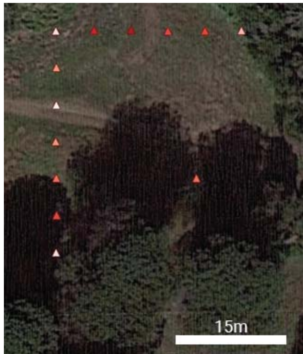
Figure 5. Absolute deviations of coordinates measured with handheld receiver from integer coordinates of nodes

The advantages of this approach are mainly two: the geometric correctness of the grid itself in terms of shape and size, and its repeatability. As far as the first aspect is concerned, it is easy to see that points surveyed with receivers that have potentially centimetric accuracies on an absolute grid (such as the UTM grid) will make it possible to obtain a final grid with a much more regular and reliable geometry, making the results statistically much more significant. Furthermore, the possibility of being able to replicate the same grid with no margin of error even years later is of considerable interest. Once again, this allows for greater reliability and significance of the data but also makes it possible to finish and resume the research work without uncertainty even after days or in subsequent campaigns, even years apart.