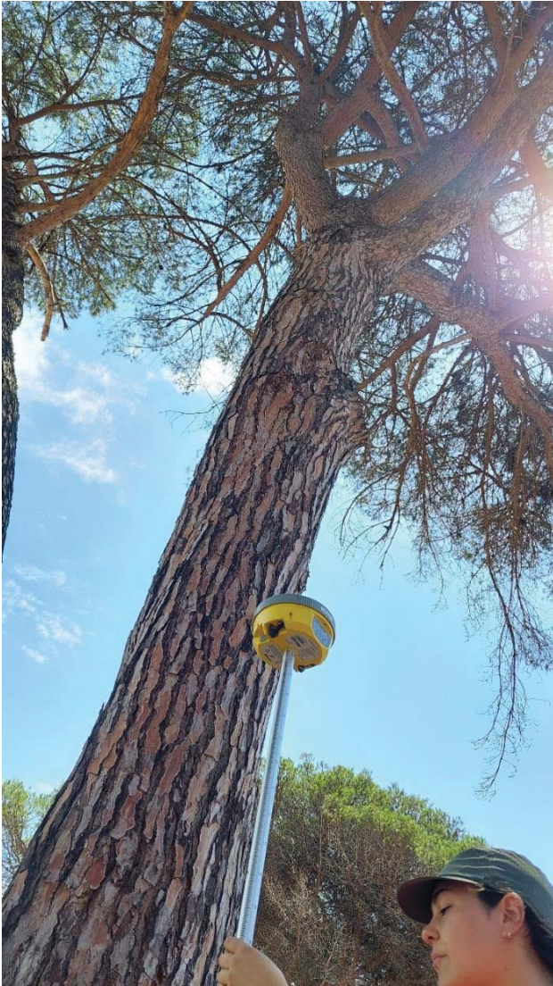
Figure 4. The survey with the Geomax receiver where the tree cover issue is evident

stations operated by the Lazio Region administration, the flat morphology, but also to the large number of observable satellites. Their layout (still fig. 5) suggests that both the physiological lower accuracy of the points identified with the metric tape and the obstructions of the trees, mainly those to the south, have an influence.