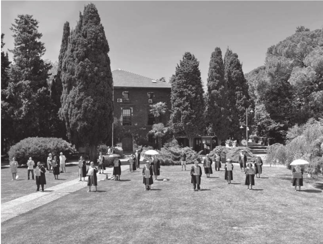
Figure 3.4 Daily vigil at noon by Boğaziçi University academics on 22 July 2022

and Gökarıksel 2022). Finally, as also voiced very clearly in the demands of the resisting academics, this is not only a matter of saving Boğaziçi University from the authoritarian takeover, but a struggle for free, autonomous and democratic universities all around the country (Gürel 2022).