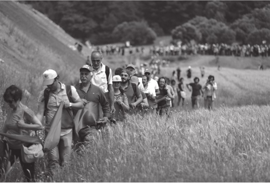
Figure 3.3 Break Free from Fossil Fuels protest on 15 May 2016

Environmental struggles and legal battles in the region are still ongoing, with the case of a discarded Brazilian navy ship loaded with hundreds of tons of asbestos heading to the region for shipbreaking as we write these lines in July 2022. Despite their shortcomings, the mobilizations in the region have been able to impact the decisions of international financial institutions as they withdraw their support from polluting investments, and allegedly influenced the design of a floating LNG terminal due to investors' fear of widespread protests against a land-based one. In addition, a cement factory decided not to invest in the region. In 2019, in a moment of déjà vu , the local court argued against the accuracy of EIA reports on two coal-fired power plant projects in Aliğa, declared them unlawful and annulled the investments again, this time based on a lack of cumulative impact assessment. The Yeni Foça Forum and other local community groups were also heavily involved in following up a major oil spill in the summer of 2019 that resulted from a ship sent to the nearby shipbreaking site in Aliğa – an incident that well illustrates the permanent state of emergency in the region, and the need for environmental defenders continuously in action.