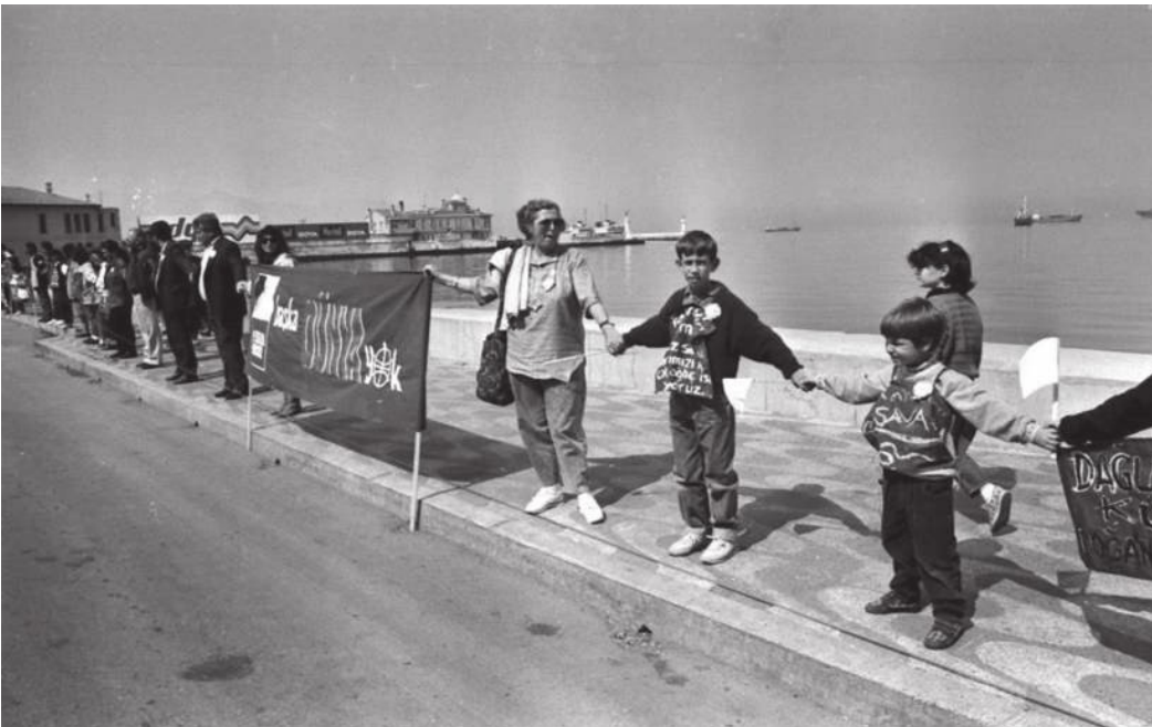
Figure 3.2 Human chain protest in 1990 against the planned coal-fired thermal power plant

Later, during the 1990s, new environmentalism grew in Turkey, on the shoulders of various environmental groups, ranging from the radical and anti-institutional to the scientific and institutional. This was mainly because, in the mid-1990s, the environment was seen as a critical entry point for a civil society where citizens were using the constitutional setting and appealing to the court to cancel project plans (Turhan et al. 2019; Aydın 2005). Legal appeals were, in general, supported by mass mobilization. This was also when the rally against the planned coal-fired thermal power plant started in the region. On 6 May 1990, more than 50,000 people formed a human chain stretching 24 km along the road connecting İzmir , the metropolitan city, to its industrial district Aliğa (see Figure 3.2). Following the demonstrations