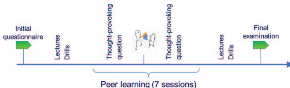
Fig. 1. – “Fisica Sperimentale A+B” design in academic year 2021–2022.

As aforementioned, students experienced seven PL sessions periodically during the