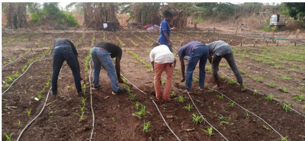
Figure 1. Experimental Field of the Studied Maize Showing Manual Weeding by Hoeing and Handpicking, and Drip Irrigation System.

Standard agronomic and management practices were adopted to raise a healthy crop. Daily watering using a Drip Irrigation System was applied uniformly to all plots. Manual weeding by hoeing and handpicking (Figure 1) were carried out when necessary to avoid any competition between the crop and the weeds, and thus allow better crop development.