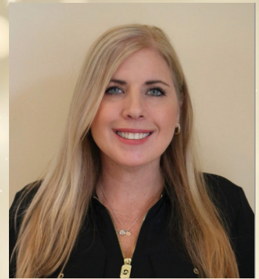
Academic Administrator for Adjunct and Online Faculty

In the next couple of weeks, please stay tuned for a brief survey where you can provide your input on the frequency and content of the adjunct newsletter. Your perspectives as members of our teaching community are greatly appreciated. It takes a lot of time planning so who better to ask than you! By working together, we can enhance communication and engagement among our talented adjunct faculty.