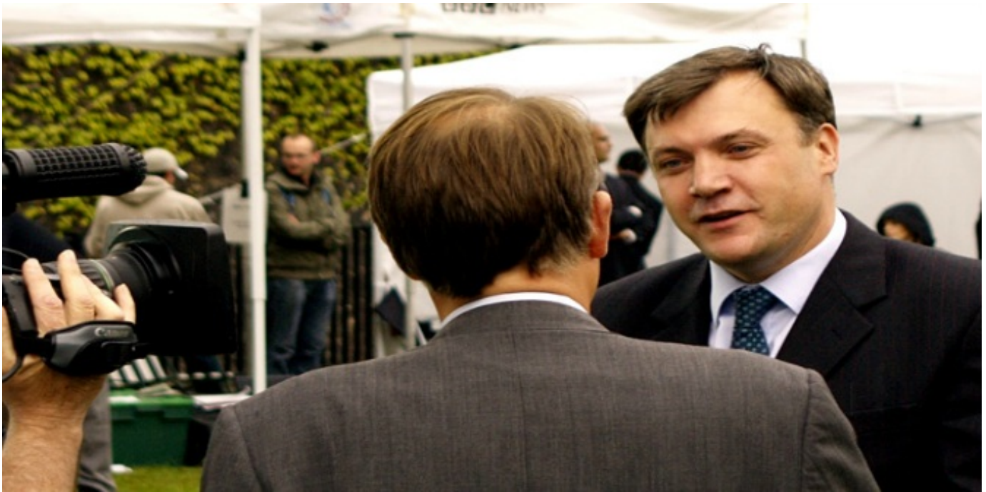
Image Credit: Ed Balls being interviewed by Michael Crick for the BBC on 27 June 2007

The defining decision of the New Labour government — to join the US invasion of Iraq — is viewed with detached and slightly bemused horror from the Gordon Brown-run Treasury. The missionary zeal in Tony Blair's personality is described as a dangerous weakness that would have probably led him to force Britain to join the Euro if he hadn't been distracted by 9/11. Blair's lack of knowledge on economic issues is detailed unsparingly: Balls recalls humiliating him in a meeting when he corrected him on the average household income for a UK family — Blair's estimate was £60,000, three times the actual figure.