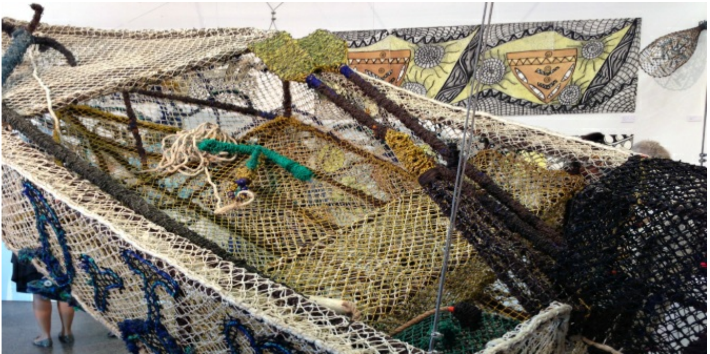
Ghostnet Dinghy 'Loyalty' by Erub Artists, Cairns Indigenous Art Fair 2014, purchased by The Australian National Gallery in Canberra

to her great credit that she is persistently aware of the nuances, risks and limitations of doing so.