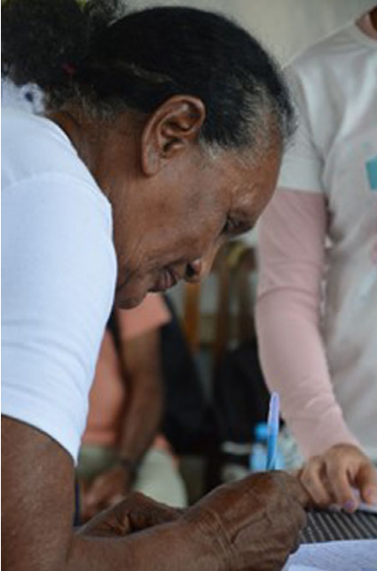
Figure 1. A member of Montanha-Mangabal signs her acceptance of the land offer following decades-long struggle for recognition.

market alongside trading companies, commercial agents, seed producers, processors, importers and exporters of soy. Despite the availability of national and international credit, new infrastructure developments, and state support, the monocropping of soybeans has faced difficulties in maintaining profitability due to increased input costs, fluctuating exchange rates, and the decade-long decline in soy prices following the 2008 financial crisis. The amount spent on capital inputs jumped from BRL 397 thousand per hectare in the 2012/2013 harvest to just over BRL 990 thousand in 2016/2017, an increase of 151%. In the following season, 2015/2016, Brazil's harvest experienced a drop of 0.8% in overall production and 4.3% in productivity levels (per hectare). Yet, throughout this period, the expansion of the planted area continued.