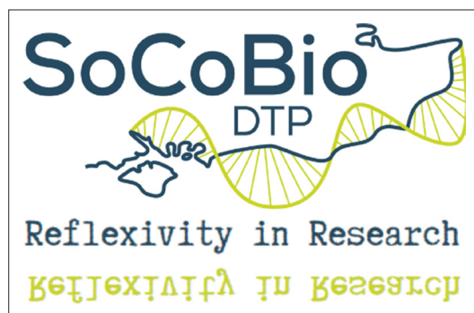
Figure 1. The logo for the SoCoBio Reflexivity in Research programme was co-created by students and staff. To reinforce the work the students completed during the Reflexivity in Research programme, we sent them a care package of gifts marked with the logo (such as seed packets, mugs and bags) to increase their sense of belonging to the programme, and to remind them of the benefits of reflexivity, especially when facing challenges.

(WISC; Leigh et al. , 2022). This project involved a collaboration between researchers in the chemical and social sciences, and drew on extensive experience of working therapeutically and addressing marginalisation in science (Egambaram et al. , 2022; Leigh and Bailey, 2013). In particular, it facilitated individuals to be more consciously aware of their embodied experiences (i.e., the thoughts, feelings, sensations, images and emotions they experienced in different scenarios), and to then feed these experiences into effective reflection (Evans-Winters, 2019; Kujawa-Holbrook and Montagno, 2009; Leigh and Brown, 2021). This included ‘owning’ experiences rather than projecting them onto others.