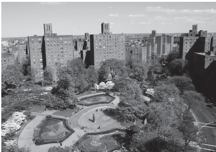
Parkchester's Metropolitan Oval.

Without any grand statements about cooperation, they simply assisted each other in making life more comfortable for those on their floor during heat waves. This open-door behavior spawned civility in building after building on an ongoing basis as floor residents of different backgrounds got to know one another as more than mere neighbors. In some instances, folks living on the same floor became trusting enough of each other that they set up intercoms with receivers in more than one apartment, making it possible for one parent or a single baby-sitter to keep track of multiple sets of children. 20