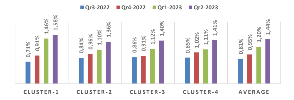
Figure 1: Business Growth Quarter 3/2022 - Quarter 2/2023