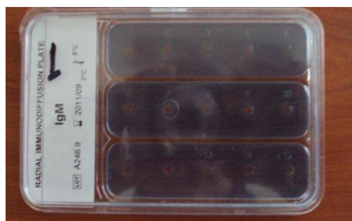
Figure 2 "Endplates of Single Radial Immunodiffusion test For IgG & IgM quantitation"