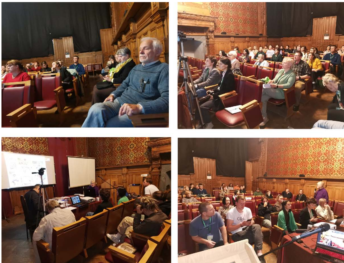
Fig. 3. Moments of the conference in the Oak Hall of the Institute for the History of Material Culture St. Petersburg

Обр. 3. Моменти от конференцията, проведена в Дъбовата зала на Института за история на материалната култура в С. Петербург