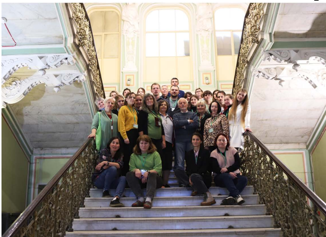
Fig. 2. 1. The team of the Laboratory for Experimental Traceology; 2. Participants of the Conference Обр. 2. 1. Екипът на Лабораторията за експериментална трасология; 2. Участници в конференцията